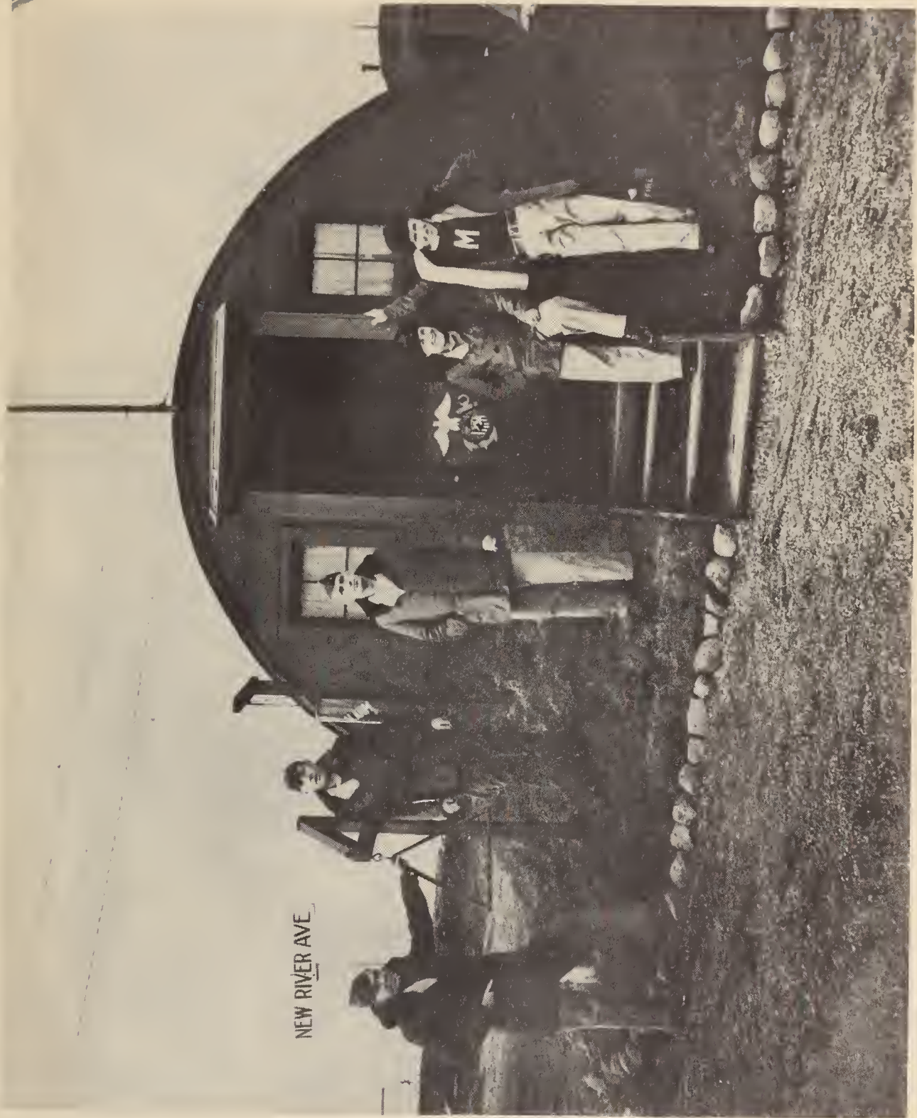
NISSEN hut, showing way in which earth bank was used to anchor and weatherproof them.