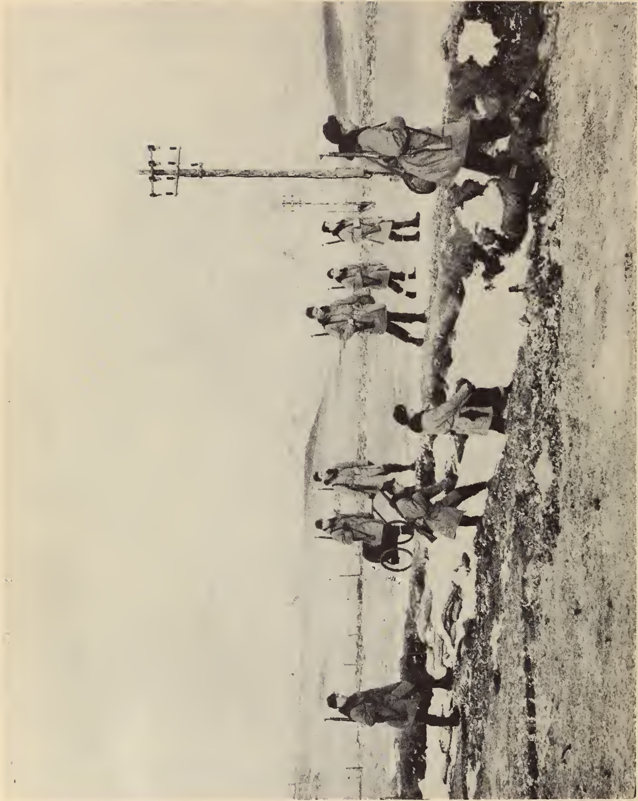
Looking northeast toward ESJA highlands.