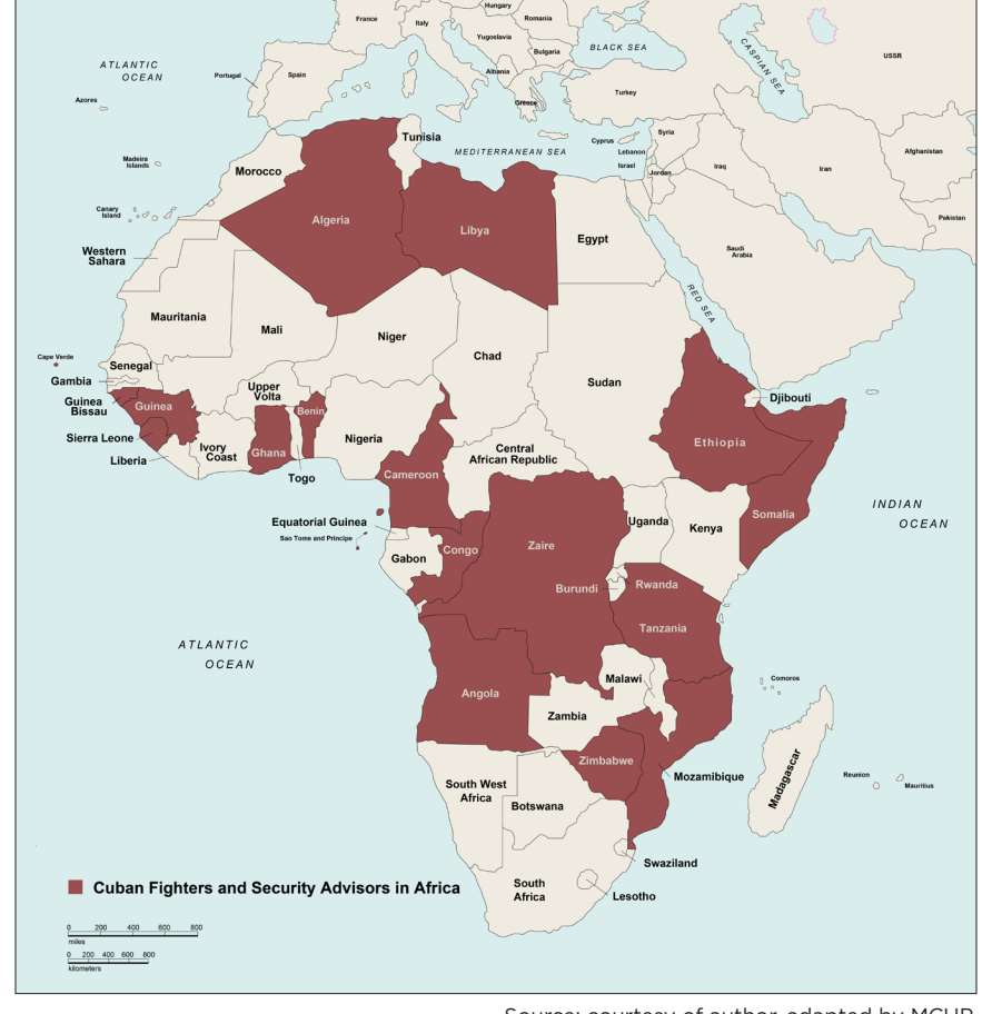
Map 2. Cuban fighters and security advisors in Africa