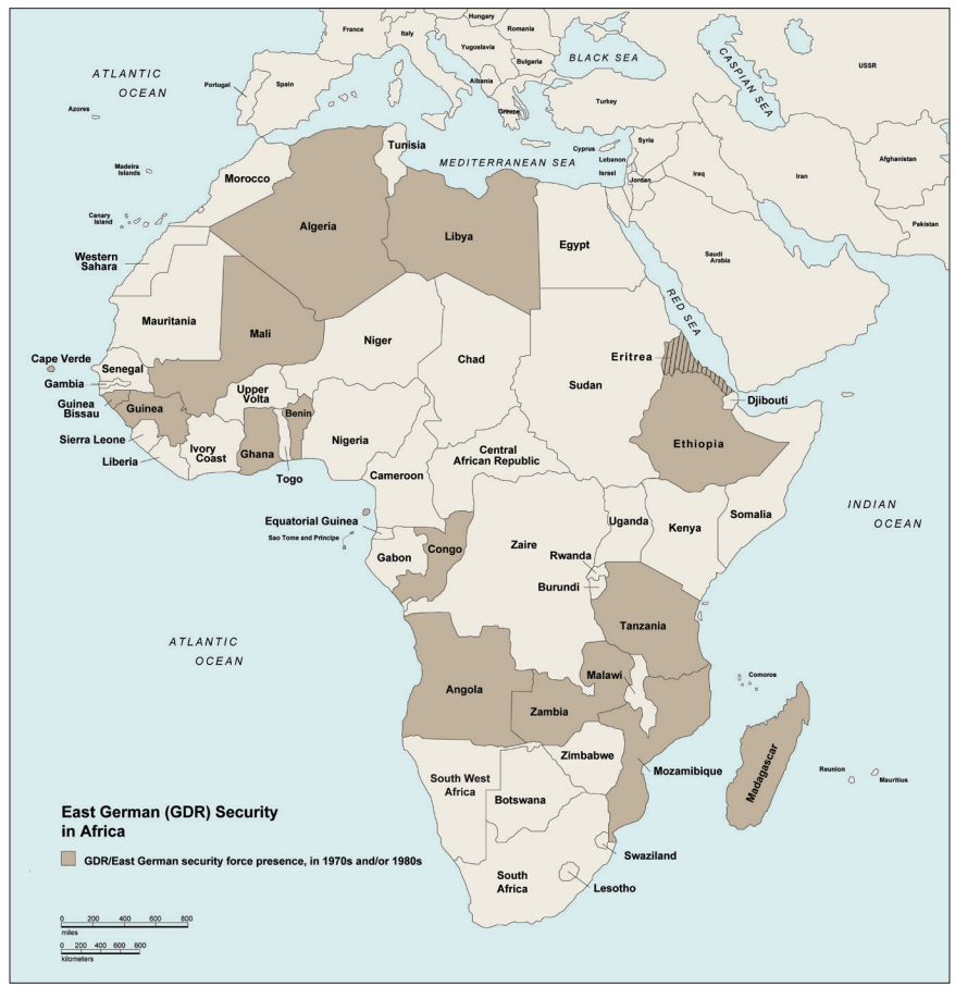
Map 1. GDR/East German security force presence in the 1970s and/or 1980s in Africa