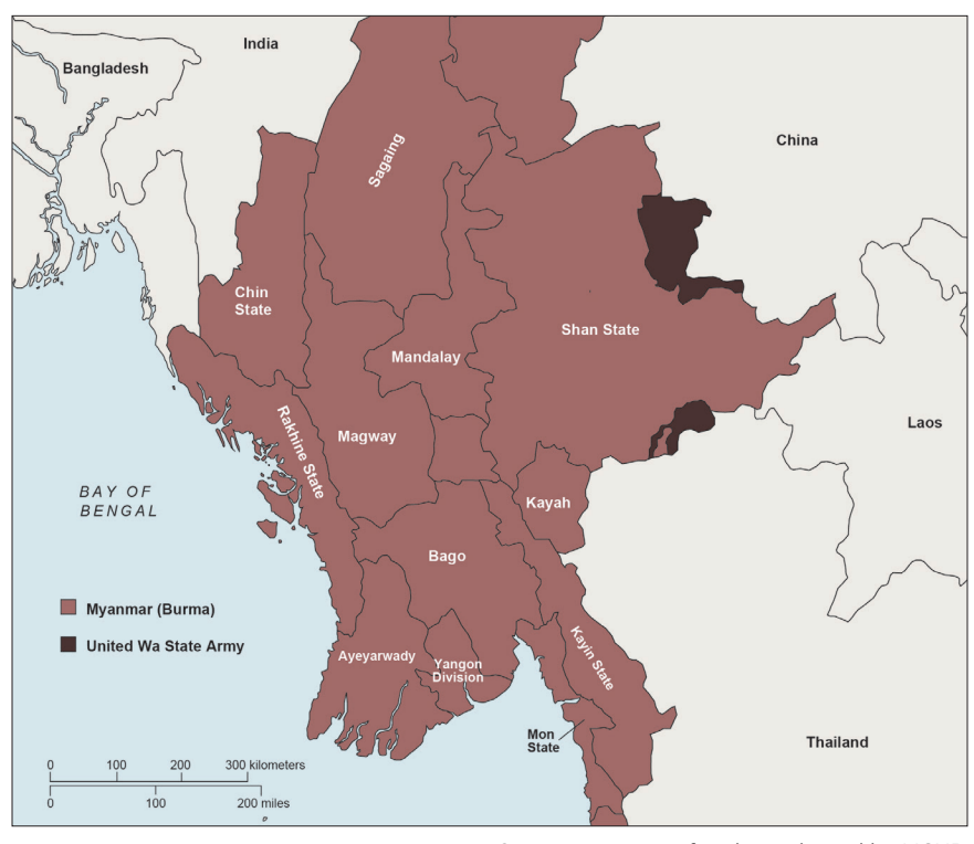
Map 6. Two-part territory of the United Wa State Army within the Shan State of Myanmar