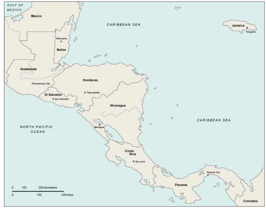
Map 3. Nicaragua and Central America