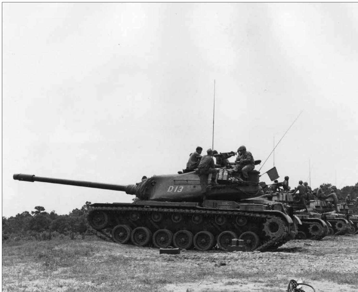
Historical Resources Branch, Marine Corps History Division

The Marine Corps operated the only U.S. heavy tank from 1958 to 1972, the M103 series (M103A2 pictured). It functioned as a “destroyer tank” to be landed after the amphibious assault to eliminate resistance centers and armored counterattacks.