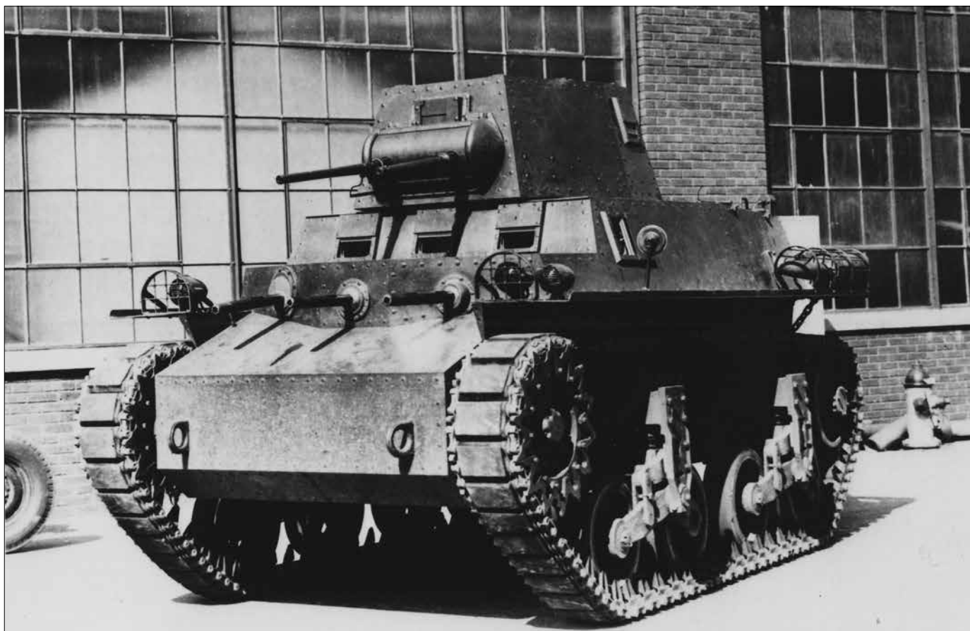
Historical Resources Branch, Marine Corps History Division

The obvious limitations of the CTL-3 led to the development of the companion medium version produced by the Marmon-Herrington Company as the CTM-3TBD. A turreted tank weighing more than 21,000 pounds, it used a diesel engine to attain a speed of 30 mph. The turret mounted a pair of .50-caliber Browning machine guns, the standard U.S. antitank weapon of the 1930s. With the three .30-caliber machine guns in the hull forward, the three-person crew seemed almost contradicted. In the end, only five were built for the Corps.