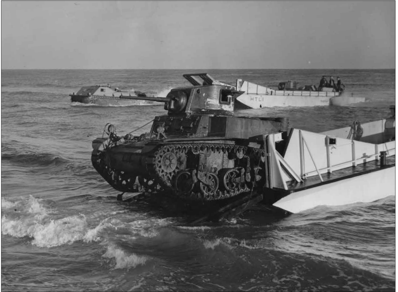
Historical Resources Branch, Marine Corps History Division

In its haste to acquire light tanks from the Army to fill out the three divisional tank battalions ordered for 1941, the Corps picked up many diesel engine versions such as this M3A1, shown exiting a Navy LCM-2 craft at Camp New River, NC. Still painted in olive drab, the Army ordnance number can be seen on the hull side. The evident speed of the vehicle exiting the landing craft may be seen on the raised hull front and blurred track shoes and sprocket wheel, indicating a green tank or craft crew, or both. The Army had decided to ban most diesel tanks from overseas service as a logistic shortcut, leaving them easy acquisitions for the Corps.