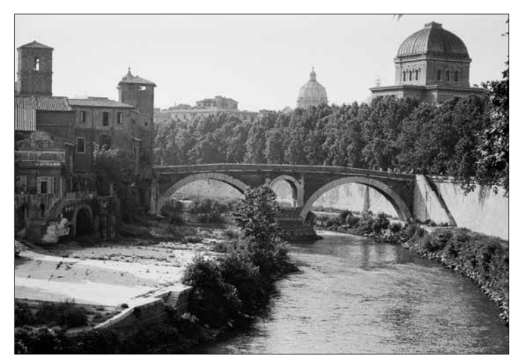
The Tiber River in Rome, showing Tiber Island on the left and the Ponte Fabrizio (Pons Fabricius) at the center. The dome on the right is the principal synagogue of Rome.

the Great Synagogue of that city.<sup>14</sup> Their voices, linked together, were carried by the magic of radio to every corner of the world. Elsewhere in North Africa, in Sicily, in France, Jewish chaplains from England and the United States have helped rebuild ruined Jewish communities; have conducted services for Jews who had been unable to worship for three years or more; have brought them religious supplies, religious books; and more important by far, religious inspiration and hope. Jewish unity has walked off the pages of our textbooks and has become a literal, visible fact.