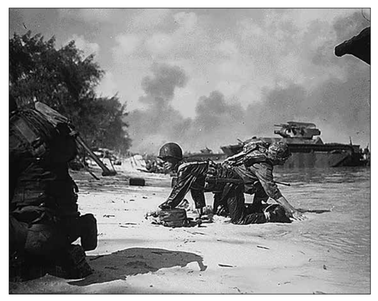
A Marine relieves another on the beach at Saipan as they crawl under enemy fire to their assigned positions, June 1944.

everything—home, wives, children, parents, even selves—forget everything except the one desperately immediate task of killing the enemy before he kills you. Gaining 50 yards here becomes the whole aim of life. Knocking out one pillbox there is for the moment the complete object of living. For an urgent hour or day, nothing else matters, nothing further counts.