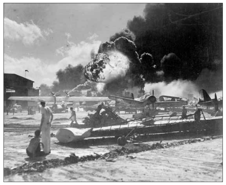
Sailors stand amid wrecked planes at the Ford Island seaplane base, watching as USS Shaw (DD 373) explodes in the center background, 7 December 1941. The USS Nevada (BB 36) is also visible in the middle background.

Reason number one–overconfidence. As one who had bitterly opposed every naval appropriation since his first high school debating days, I was convinced that the United States, and especially the United States Navy, had built up (unnecessarily?) a defense well-nigh impregnable. Pearl Harbor had not been attacked, because it could not be attacked.<sup>3</sup> It was as simple as all that! More than once, as British Prime Minister Neville Chamberlain's sinister umbrella pointed its way to inevitable