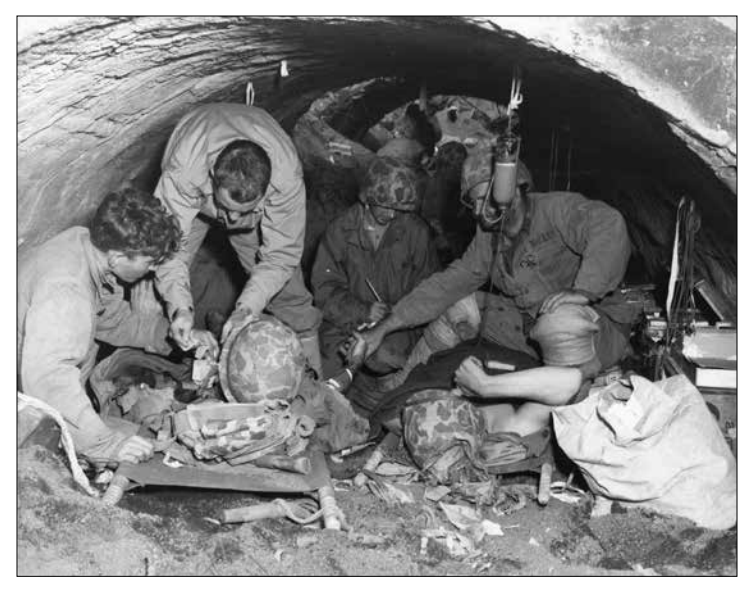
Marines, wounded in the battle for Iwo Jima, shelter in a Japanese concrete air raid shelter that was not completely destroyed in the three-day bombardment and aerial attack preceding the landing.

The aim of this chapter is rather to discuss certain types of activity that come more technically under the heading of religion. For example, from time to time, men the Service have serious problems that stem directly from their religious beliefs. As with the problem of the religious conscientious objector—as distinct from the type we have already spoken of, whose objection did not stem from religious belief—who did not raise the issue at the time of his induction, either because he was anxious to perform his patriotic duty or perhaps because he just did not know his rights in this respect, but who finds now that he cannot in good conscience and faith face the thought of killing another human