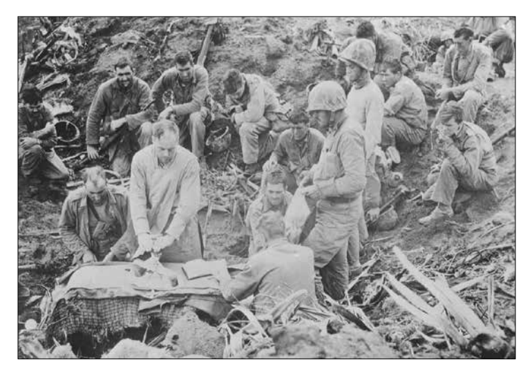
Mass on the mount, 1945.

through nearly five weeks of miserable hell. Some of us at least had served men of all faiths and of no faith, without making denomination or affiliation a prerequisite for help. Protestants, Catholics, and Jews had lived together, fought together, died together, and now lay buried together. But we the living could not unite to pray together. My chief consolation was that another Jew besides myself would have been unacceptable as dedicator of the cemetery—even though these very men professed to teach in his name.<sup>13</sup>