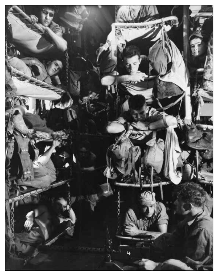
The 5th Marine Division, enroute to Iwo Jima, make themselves as comfortable as possible in their cramped quarters aboard the transport.

foot after the other as they passed down the long rows of crosses and stars looking for the name of a missing buddy. Marines who never cried over their own hurts and wounds were not ashamed