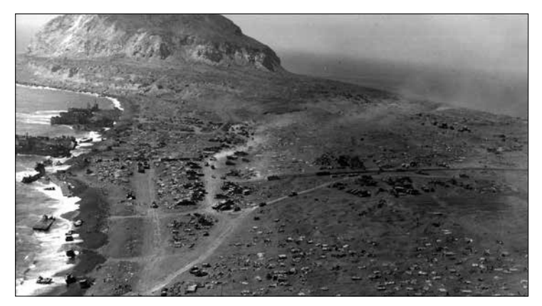
Aerial view of the Marine Corps beachhead, 12 days after landing on Iwo Jima, 1945.

Anyone who reads such views with understanding intelligence will see in them not only the greatest promise, but equally the highest challenge that organized religion has faced in a long time. Men will not return from the wars willing to accept just any kind of religion. They will return ready to listen, ready to give civilian religion a chance. They will return ready to see if their minister, priest, or rabbi is a "good Joe," as their chaplain was, whether he speaks the same language and faces the same problems.<sup>8</sup> If he does, and if toward the solution of those prob-