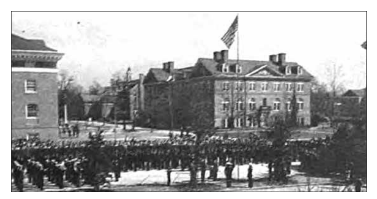
Raising of the flag in commissioning ceremonies at Williamsburg, 24 March 1943.

sin of Virginia has ever heard, we loved it! It was more fun than a month of Sunday school picnics.