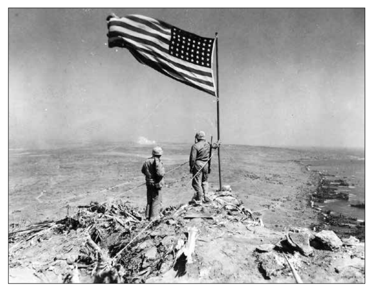
Flag raised on Mount Suribachi.

to the very summit, sat down on a log to rest. A Seabee, his cap cocked jauntily on his head, shuffled over and drawled: "Hey you guys, you'll have to move. I gotta push a road through here." As though bulldozing a road to the top of a rocky volcano were just an ordinary day's work.