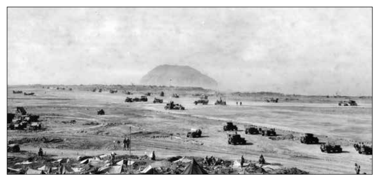
Having pushed the Japanese back from Motoyama Airfield Number 1, the U.S. Marines commence immediate construction work on the Iwo Jima bomber strip. In the background, Mount Suribachi is visible.

fragments, while other pieces continued to fall all around them. Not all the heroes of Iwo Jima are even known by name.