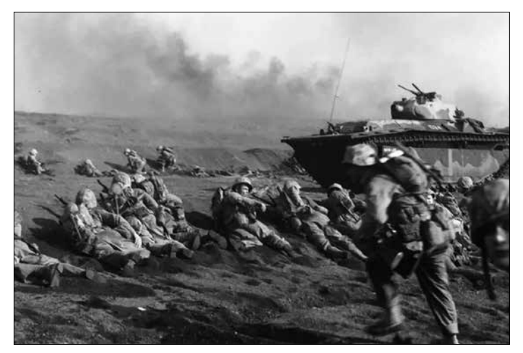
U.S. Marines of 2d Battalion, 27th Regiment, wait to move inland on Iwo Jima, soon after going ashore on 19 February 1945. An LVT(A)-5 amphibious tractor is in the background.