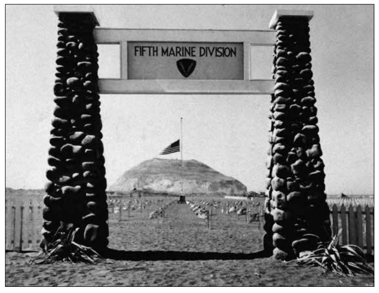
Entrance to the 5th Marine Division Cemetery, ca. February-March 1945.

for all to live in plenty, with poverty and hardship for none. Now, they lie here silently in this sacred soil, and we gather to consecrate this earth in their memory.