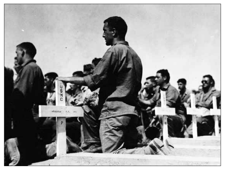
Marine kneels at a cemetery cross during dedication ceremonies on Iwo Jima, 15 March 1945.