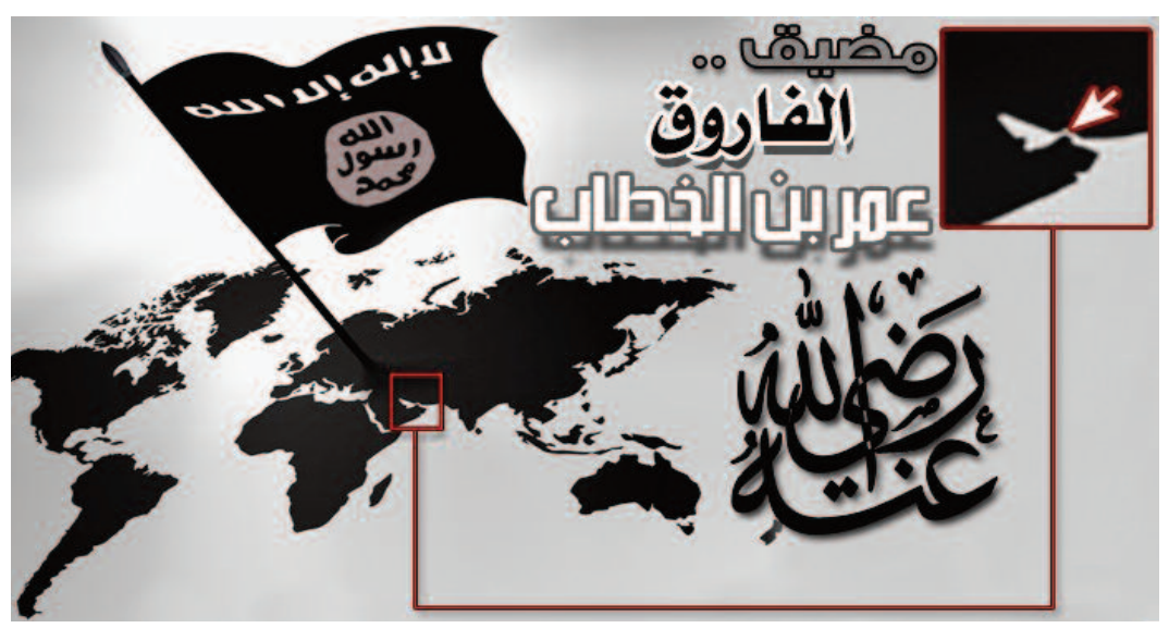
Figure 1. The Strait of Hormuz (renamed in jihadist sources after the Caliph Umar bin Khattab) as an enduring focal point for al-Qaeda in the Arabian Peninsula, al-Luyuth forum, 2011.

An additional geographical dimension of the jihadists' focus has been key terrain where maritime traffic is most vulnerable, whether due to natural features or to artificial ones. Specifically, from the perspective of geography, Abu Ubayd al-Qurayshi had urged already in 2002 that chokepoints such as the Bosporus, Gibraltar, the Suez Canal, the Strait of Malacca, the Strait of Hormuz, and the Bab al-Mandab be made priority target areas. <sup>76</sup> (See Figure 1)