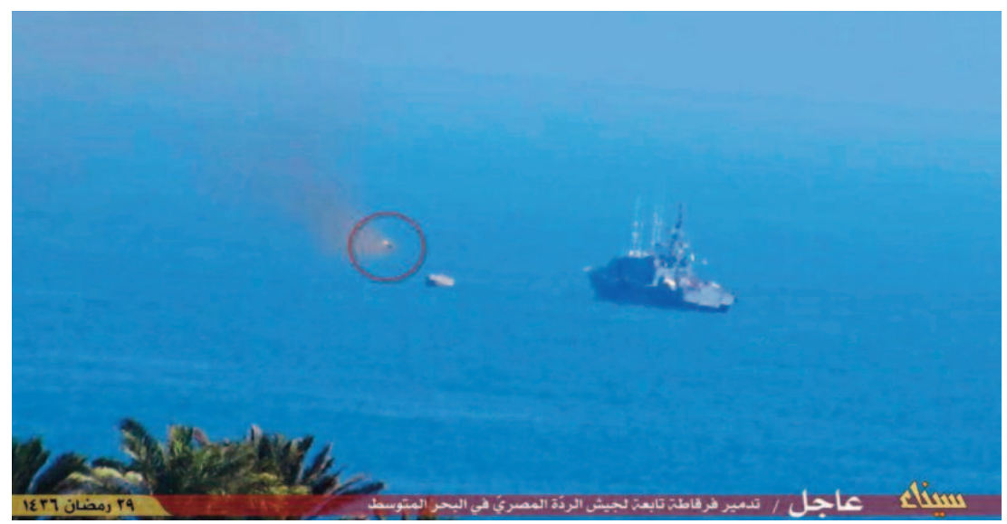
Figure 2. Projectile fired from the Sinai shore at the Egyptian ship, Islamic State online, 16 July 2015.

In a subsequent incident, Egyptian forces foiled another potential attack when they arrested a cell in Sinai in December 2014, when they found scuba diving gear and suggested that another attack on a warship was being planned.<sup>120</sup> Another attack, in July 2015, was somewhat better documented, not least thanks to photographic evidence provided by the attackers, the same group that had been involved in the previous strike. (See Figure 2)