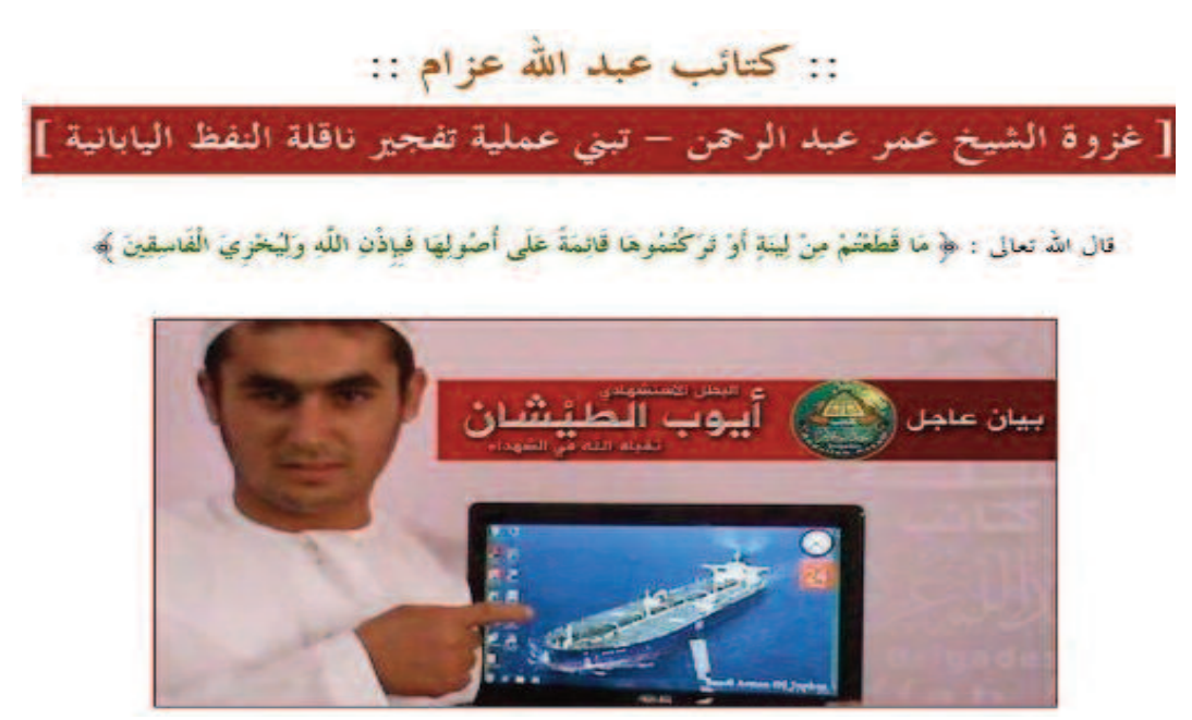
Figure 3. Al-Qaeda boasted widely in its media of the attack on the Japanese oil tanker M. Star , Kata'ib Abd Allah Azzam website, 2010.

Typically, in the attack on the M. Star oil super tanker in 2010, in addition to the intended economic objective ("to weaken the infidel global system, which plunders the Muslims' riches"), the al-Qaeda-affiliated attackers also claimed to be retaliating for the incarceration of Shaykh Omar Abd al-Rahman in the United States on terrorist charges.<sup>183</sup> (See Figure 3)