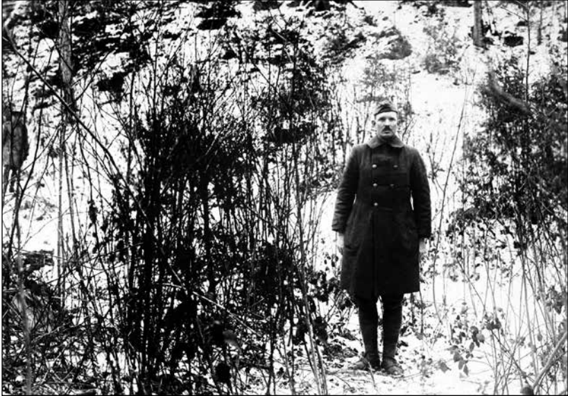
Sergeant Alvin C. York, 328 th Infantry, who with the aid of 7 men captured 132 German prisoners, shows the hill on which the raid took place on October 8, 1918, in the Argonne Forest, near Cornay, France, after World War I