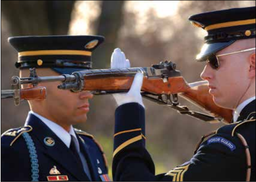
A member of the 3 rd U.S. Infantry, The Old Guard, inspects a relieving guard's rifle before his watch at the Tomb of the Unknown Soldier, Arlington National Cemetery, January 9, 2008