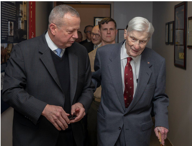
General John R. Allen, USMC (Ret.) escorts Senator John Warner (Ret.) to the Krulak Center.