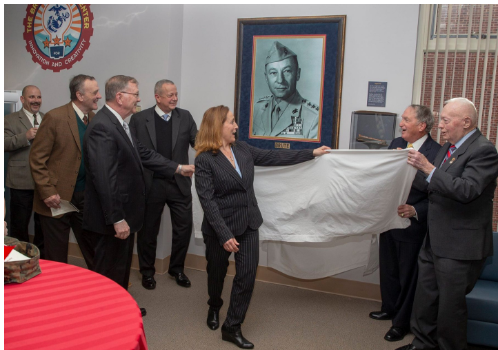
Unveiling of LtGen Victor "Brute" Krulak's photo and Higgins Boat statue, which is only 1 of 5 statues ever made. The Higgins Boat statue was given to then Col Krulak in 1944, by Andrew Higgins.