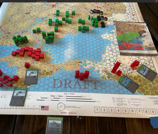
(left) A prototype scenario for Fleet Marine Force with Russian and Ukrainian brigade orders of battle created by #TeamKrulak staff.