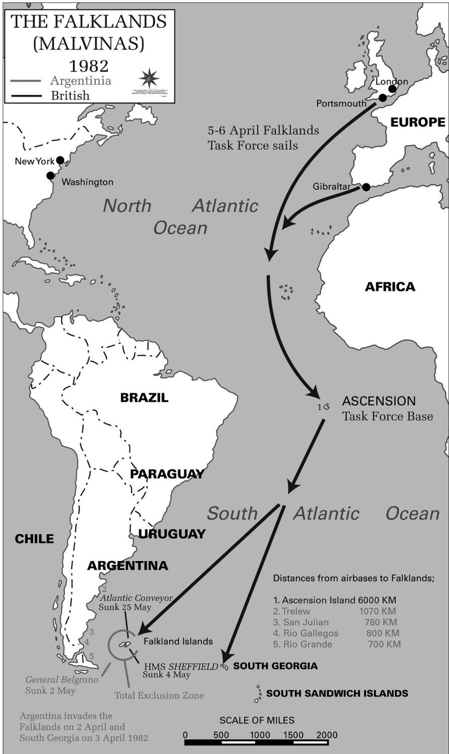
Map 1. Route and distances of the British task force