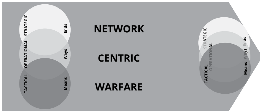
Figure 2. Network-centric warfare and levels of warfare