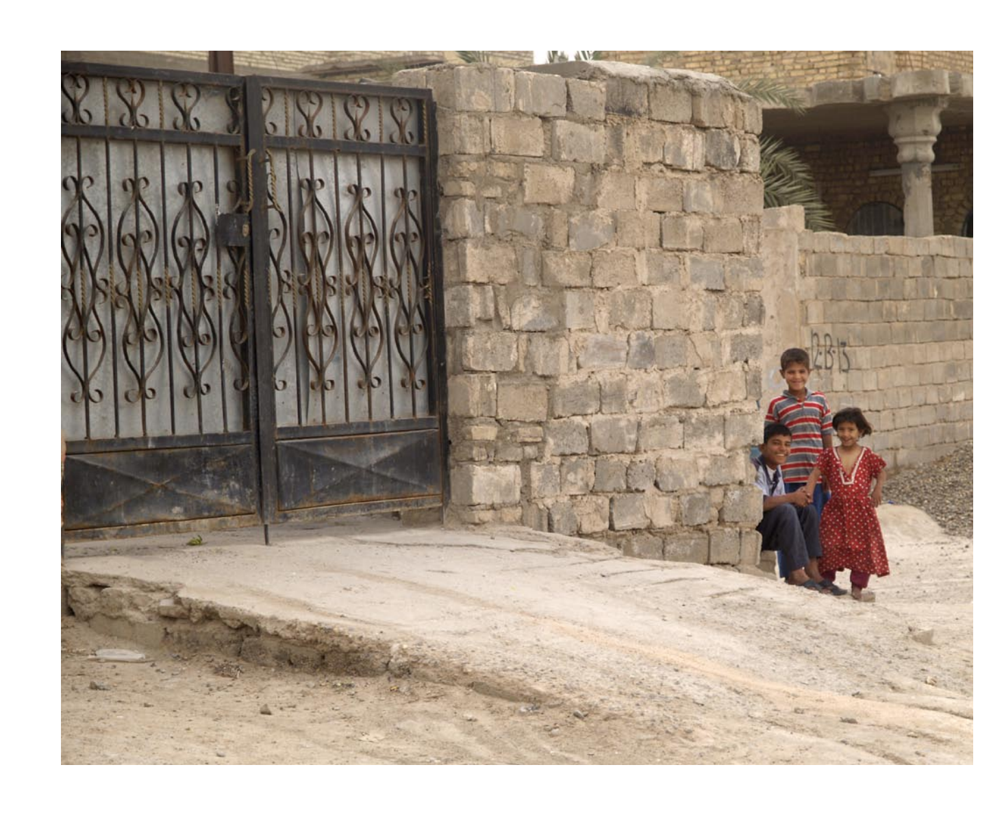
Above, Right, and following two pages: Iraqi children, at first very timid, ultimately approach Marines awaiting arrival of Iraqi Security Forces to conduct a search for a reported cache site.