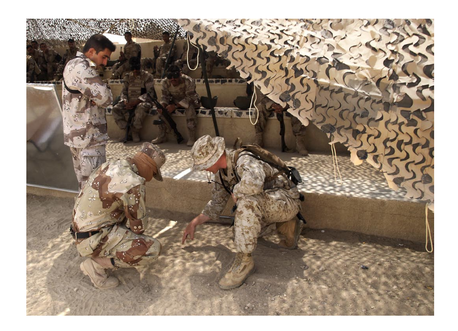
"Our job: we will live, eat, sleep, fight, bleed, and die, with our Iraqi counterparts."

Email to AST selectees informing them of their upcoming mission