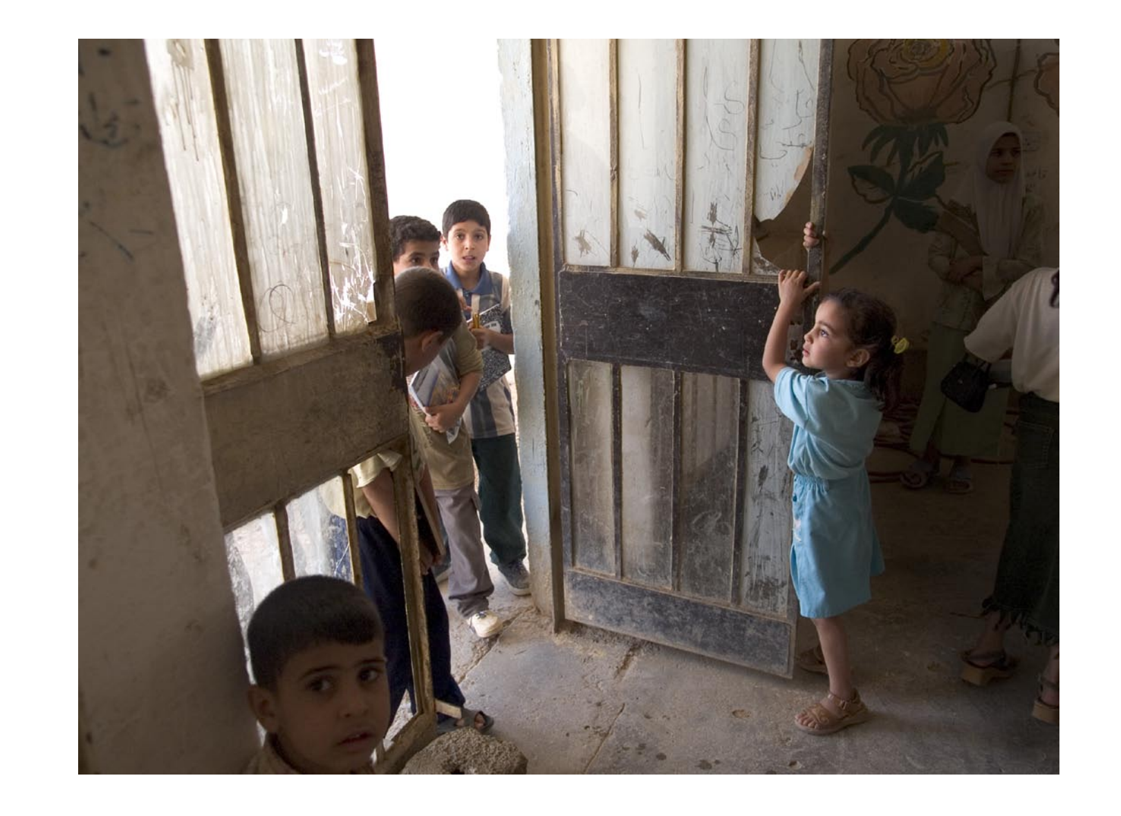
Left: An adolescent Iraqi girl shies from attention, as was often the case.

Above: The excitement winds down as the supply distribution ends and the civil affairs team prepares to depart.