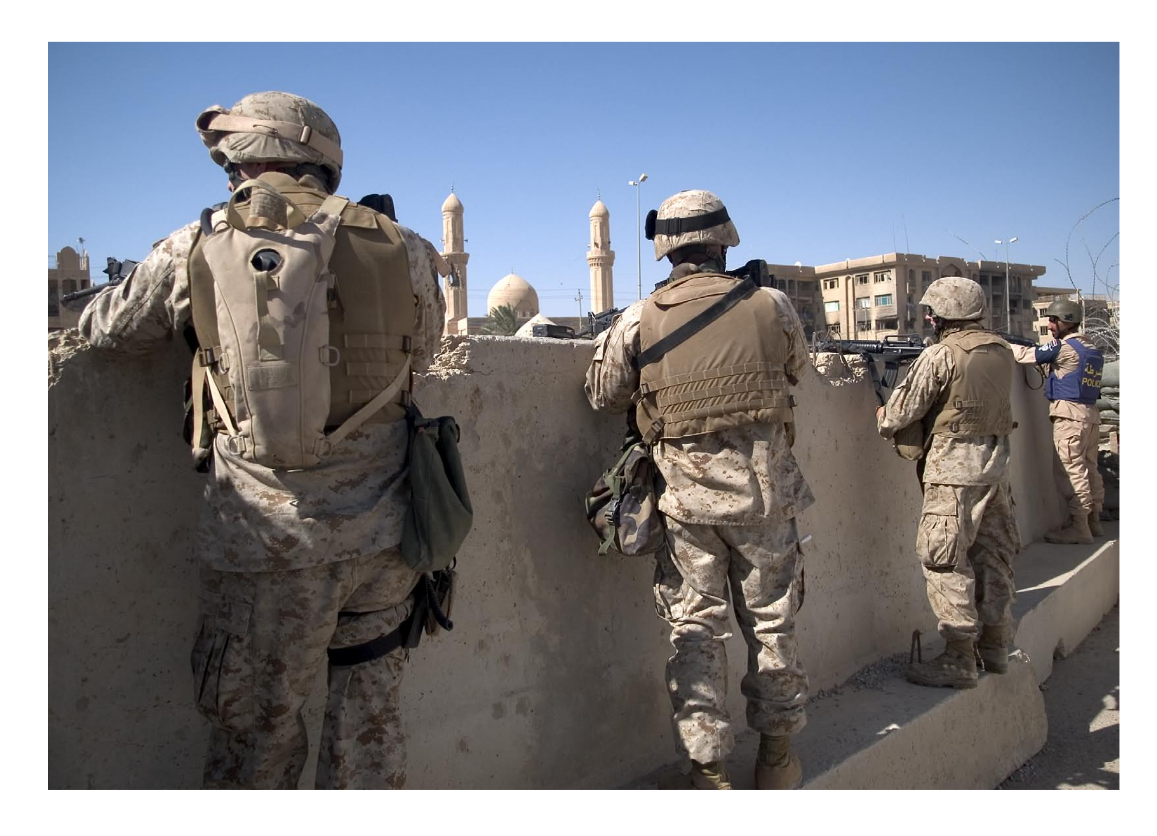
Left and Facing Page: ISF (police) and Marines man security positions side-by-side at the Fallujah CMOC.