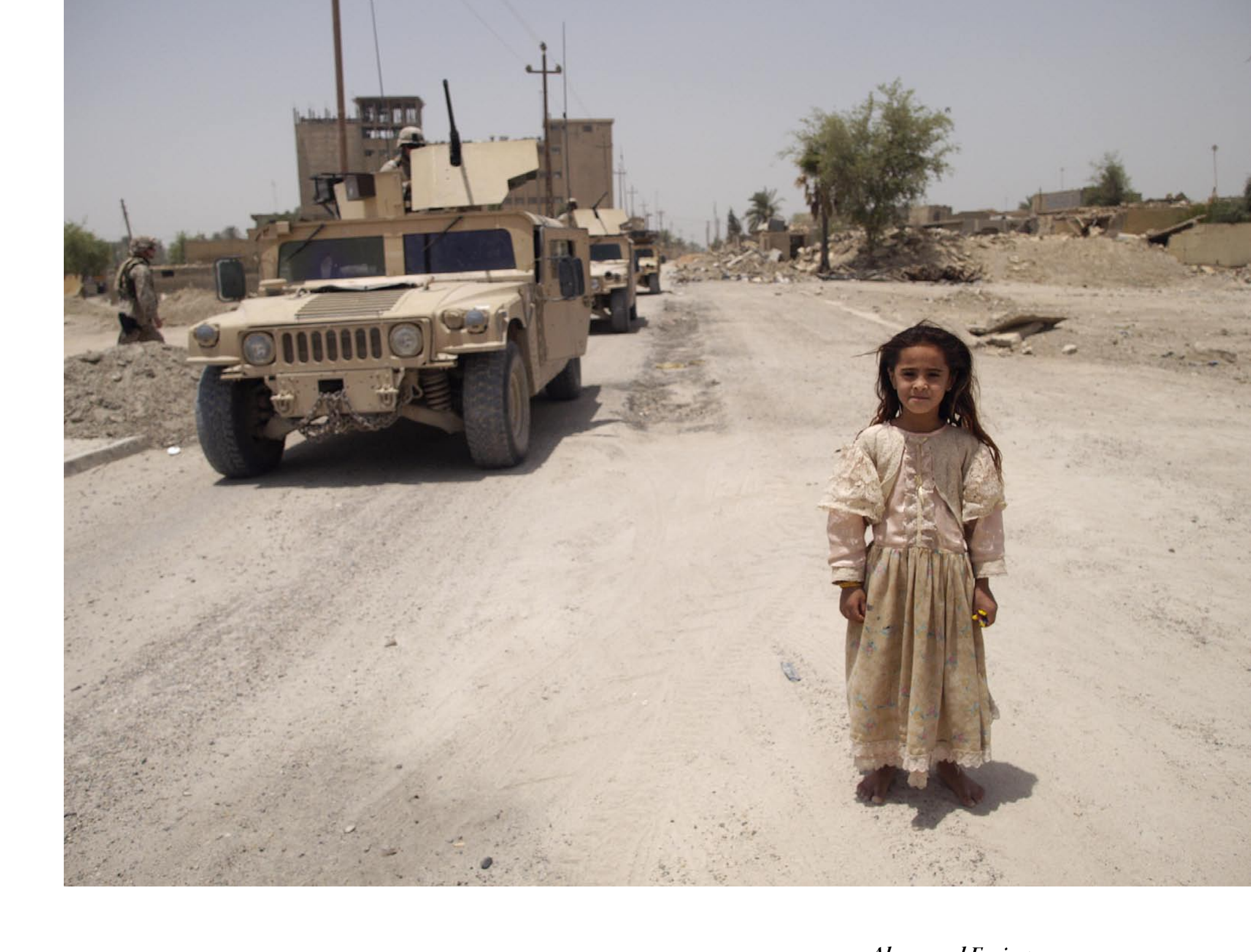
Above and Facing Page: Marines inspect construction of a new Iraqi police station in Fallujah.