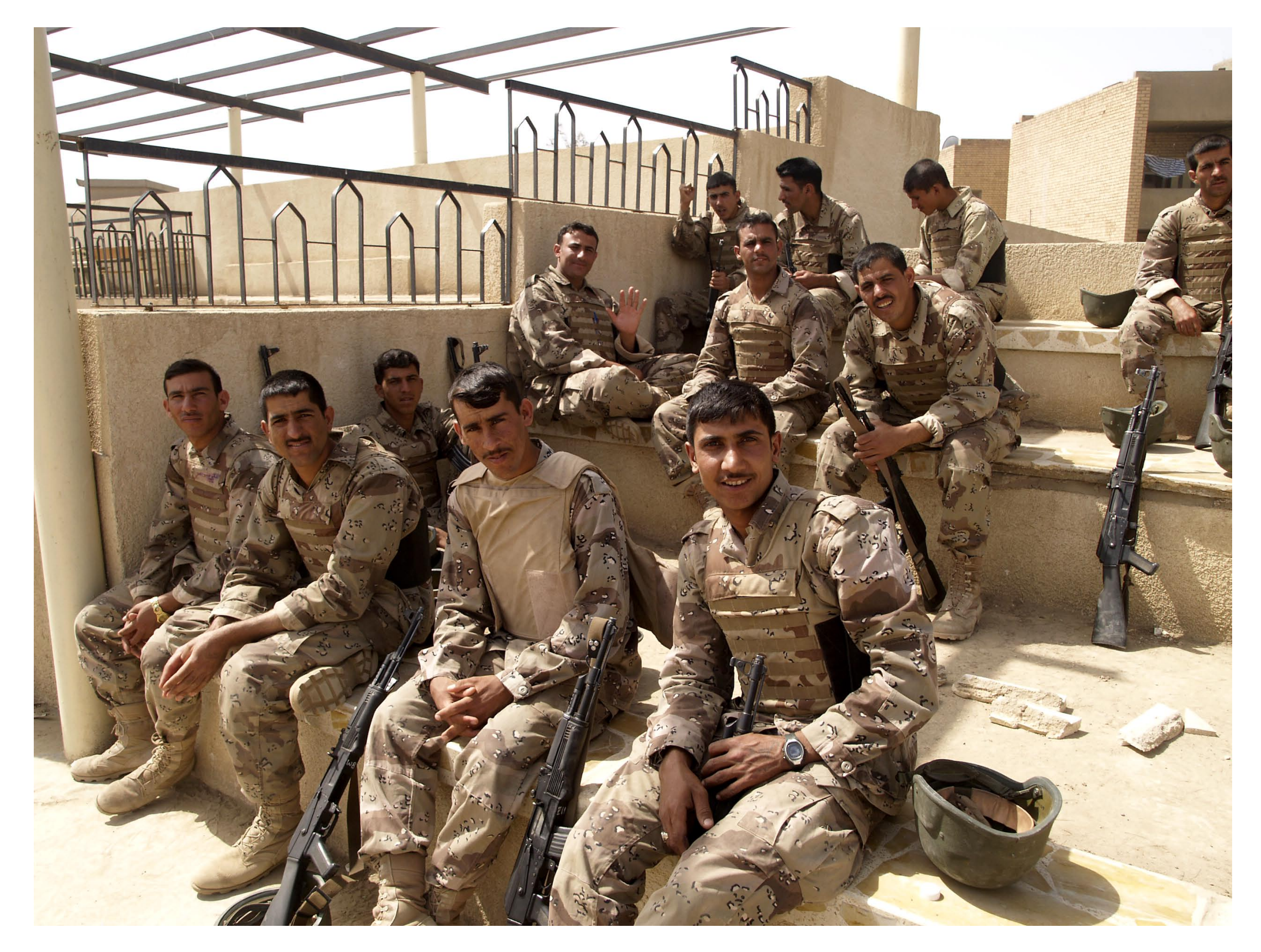
Above: Iraqi Security Forces take a break during a training exercise.

"I've never met a more friendly or generous group of soldiers...in my nineteen years in the Marine Corps; the third or fourth night we were here they were giving...a going away dinner [for one of the ASTs]...and these people don't make a lot of money...but they all chipped in and went out in town and bought him a lamb to show him their appreciation for all he had done for them."