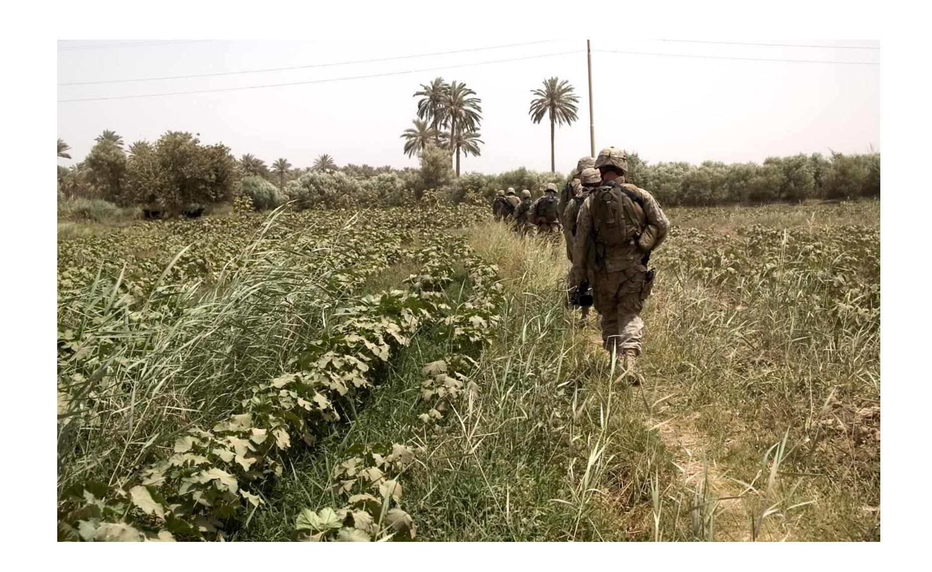
Left and Above: Team 2, Detachment 2, 5th CAG enroute to conduct an assessment at another water pumping station.