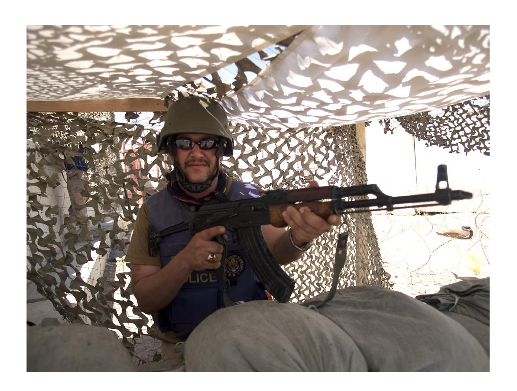
"If they consider you a brother, what you say holds a lot more credence than if they just consider you somebody that's working with them."