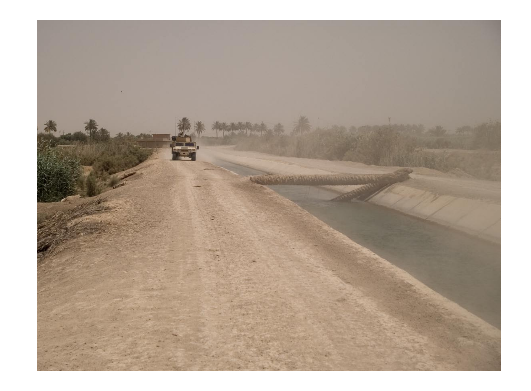
Above: A CAG team enroute to another assessment; when not foot mobile, they typically travel in small convoys and provide their own security.