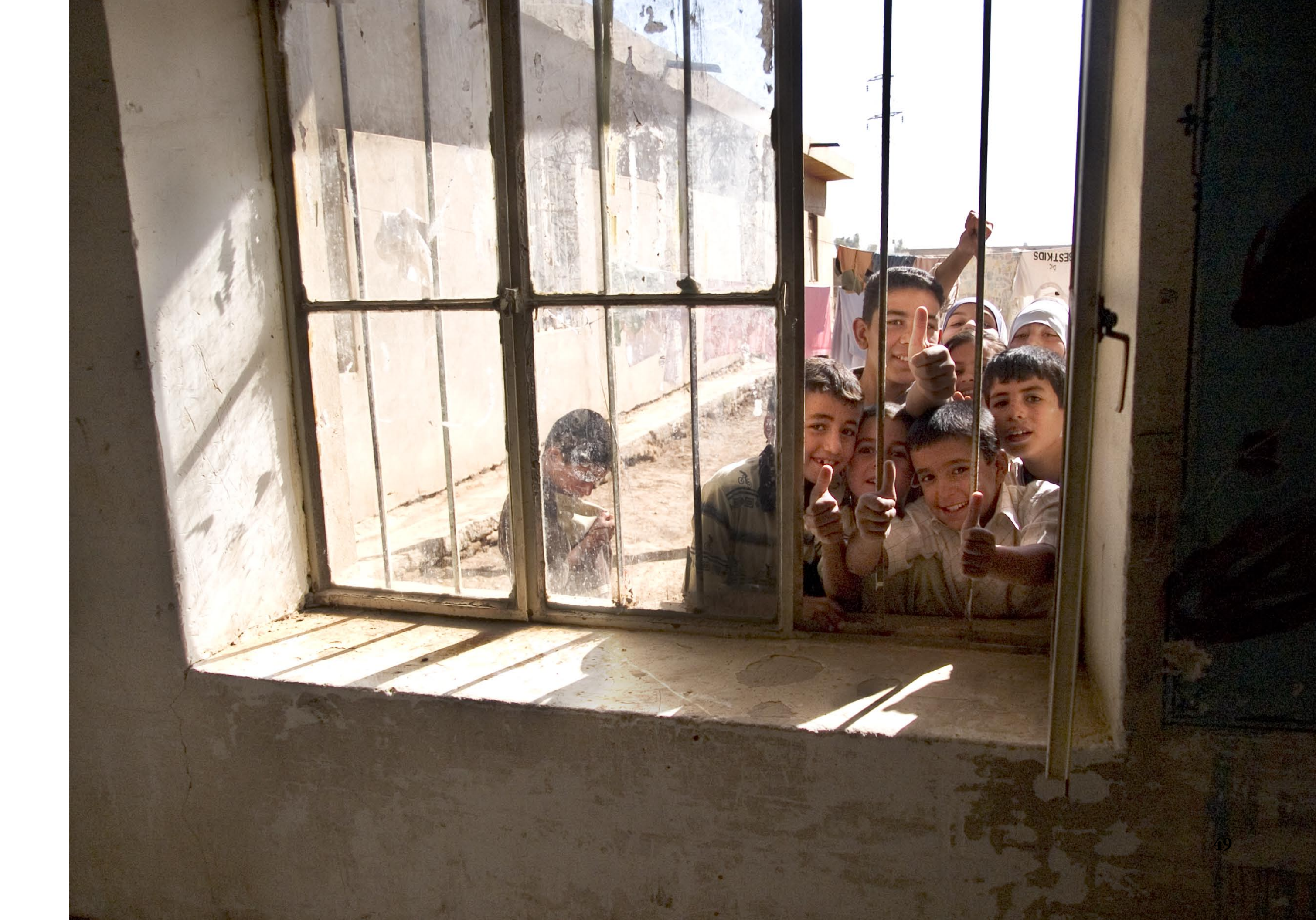
Pages 50–55: Anxiousness gives way to satisfaction, as students receive school supplies.