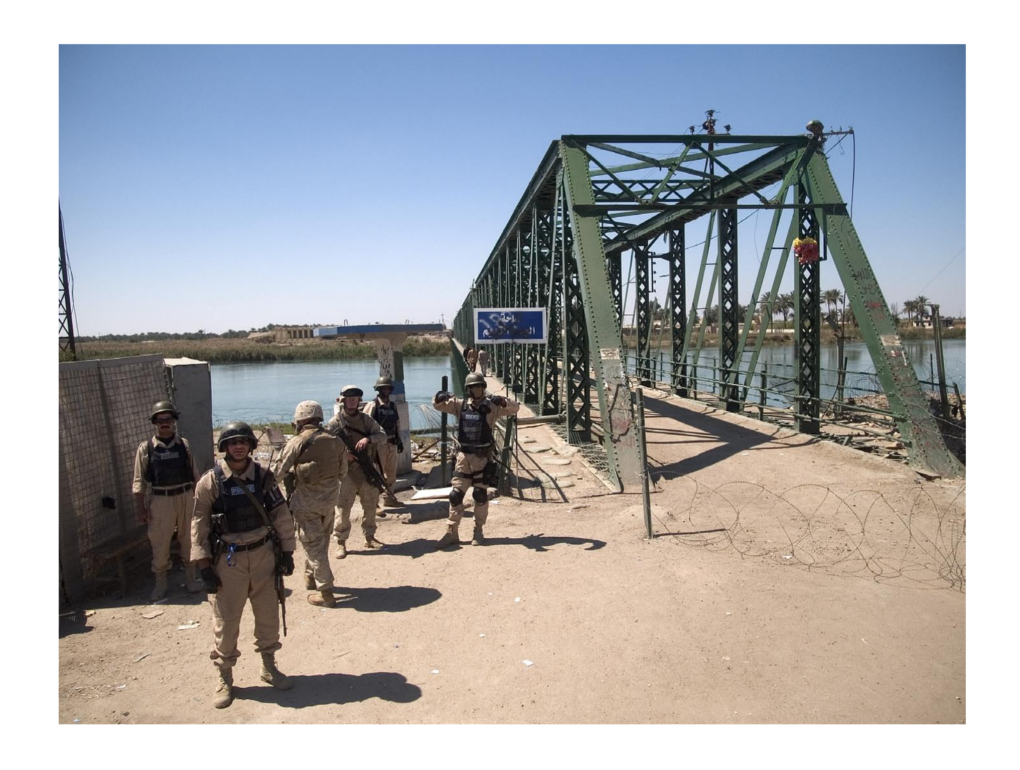
Above: Police man security positions alongside Marines at "Blackwater Bridge," on the Euphrates in Fallujah.

"It's like growing a tree. It takes awhile, and while the tree is very young, you can kick it over or pull it up...but if you support it and you keep watering it...it grows and it's stronger. Then, you can't knock it over. We're guiding them, we're supporting them, we're watering them everyday. And they're getting stronger everyday and before long, they're gonna be strong enough that they're not gonna get blown over or pulled out by the roots."