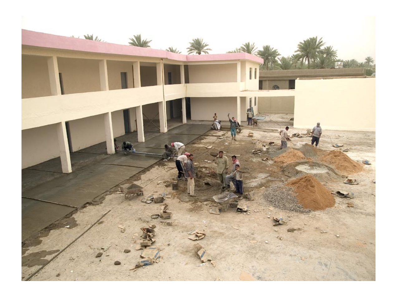
Above and Facing: Team 2, Detachment 2, 5th CAG members inspect school renovations on outskirts of Karmah.