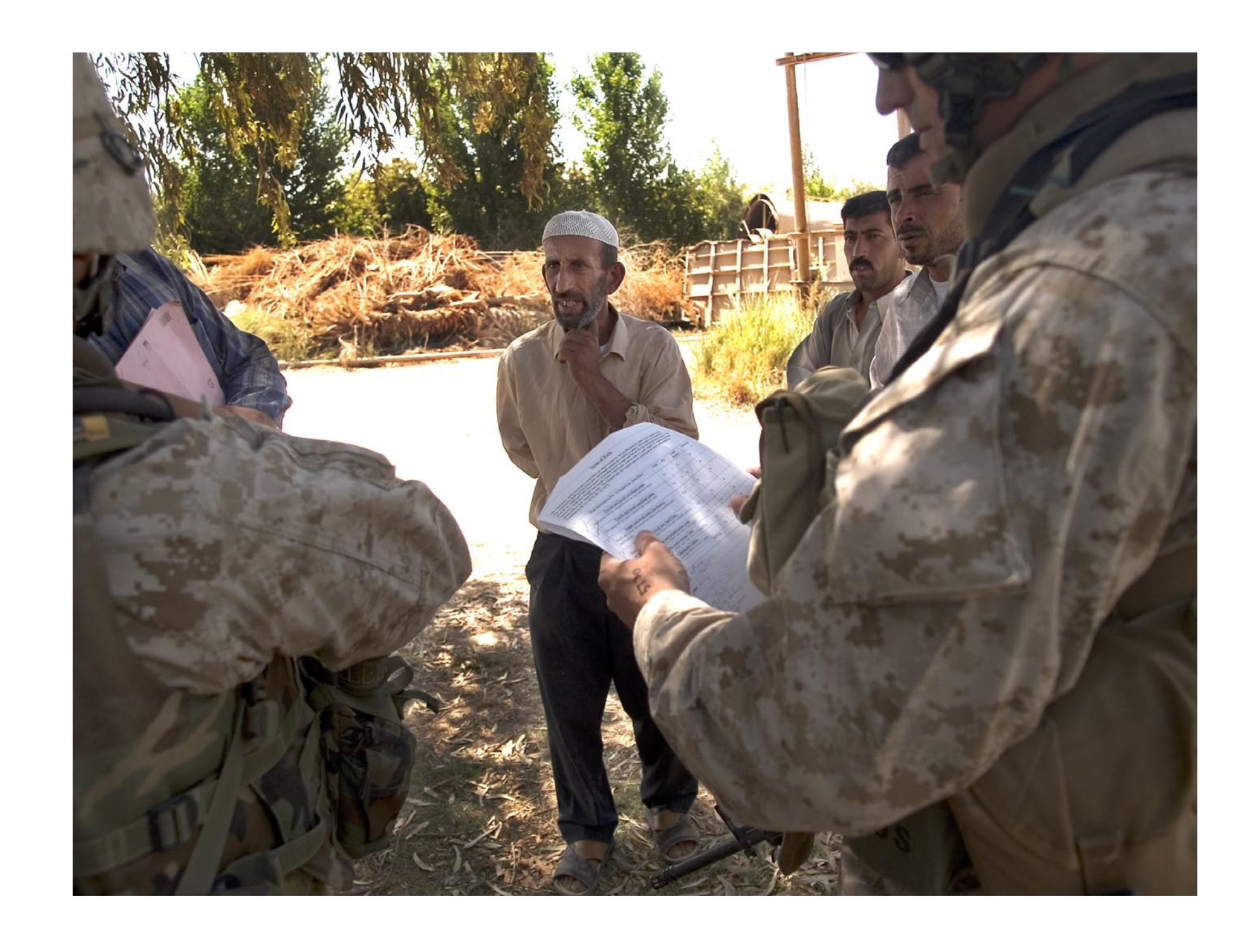
Above: A CAG team assesses a water pumping station on the Euphrates near Fallujah; this station had no functioning purification system.

"I think probably the number one trait that any civil affairs Marine can have—whether you're an officer or enlisted—is you've got to be a good listener; you've got to sit there and be a sponge and you have to listen to problems...and let me tell you, there are a hell of a lot more problems than there are people who don't have problems."