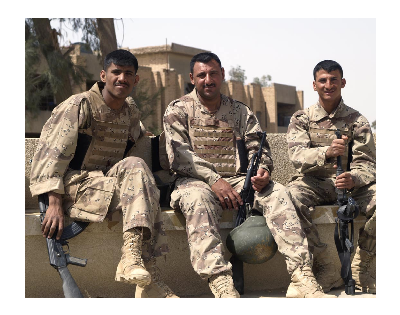
"One of the first things we had to realize is... to quit thinking of them as Iraqis and think of them as people."