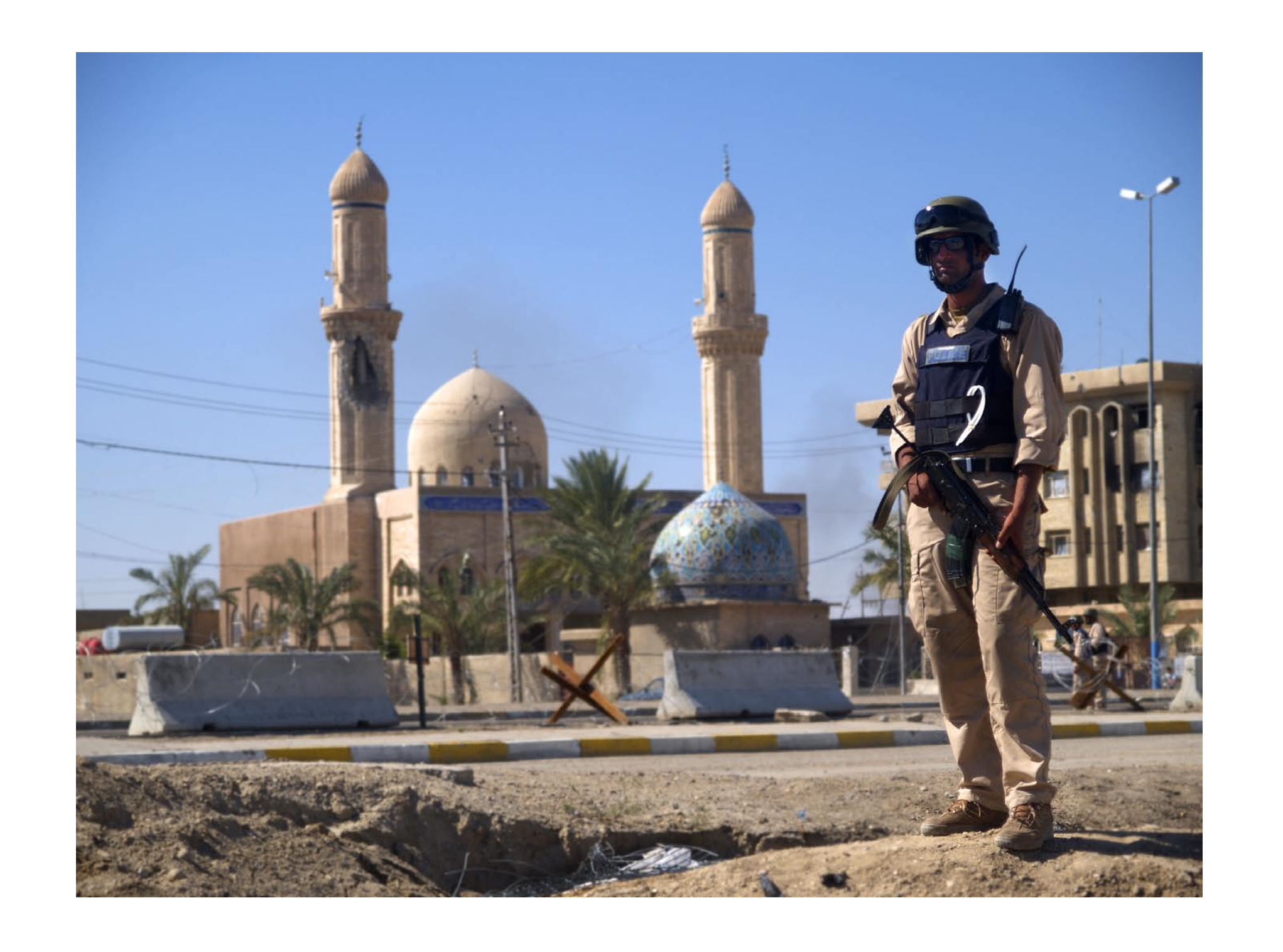
Above: A lone ISF (police) member stands guard outside the Fallujah CMOC, the site of frequent small arms attacks.