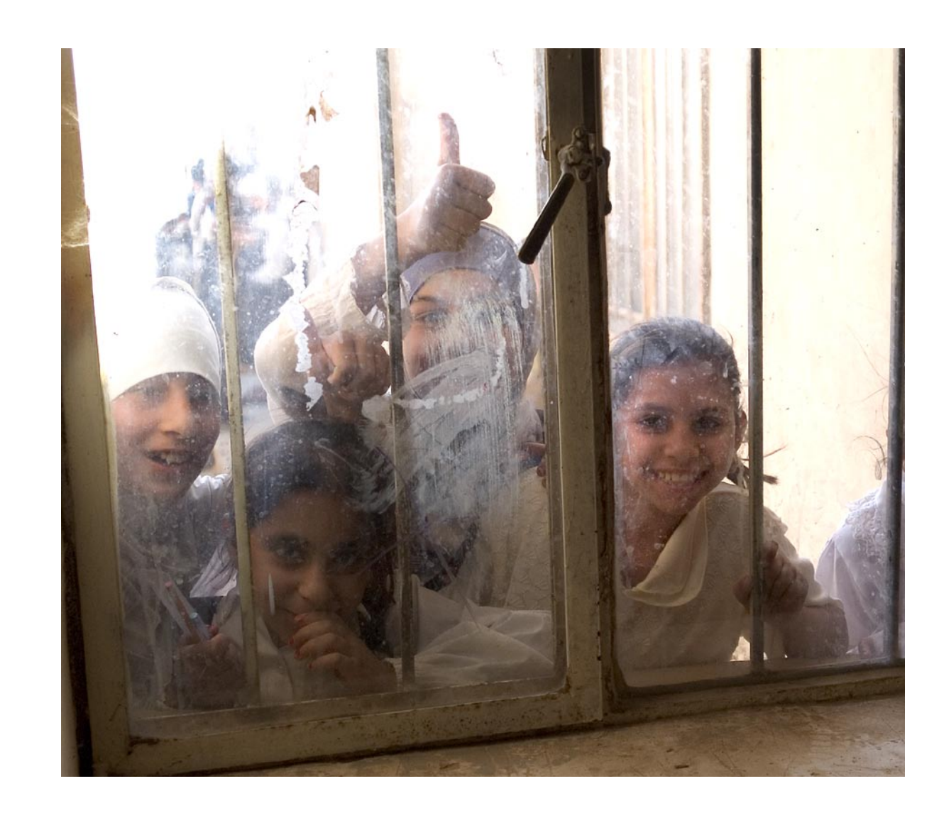
Above and Right: Elementary school children in Saqlawiyah anxiously await distribution of school supplies by Team 2, Detachment 2, 5th CAG.