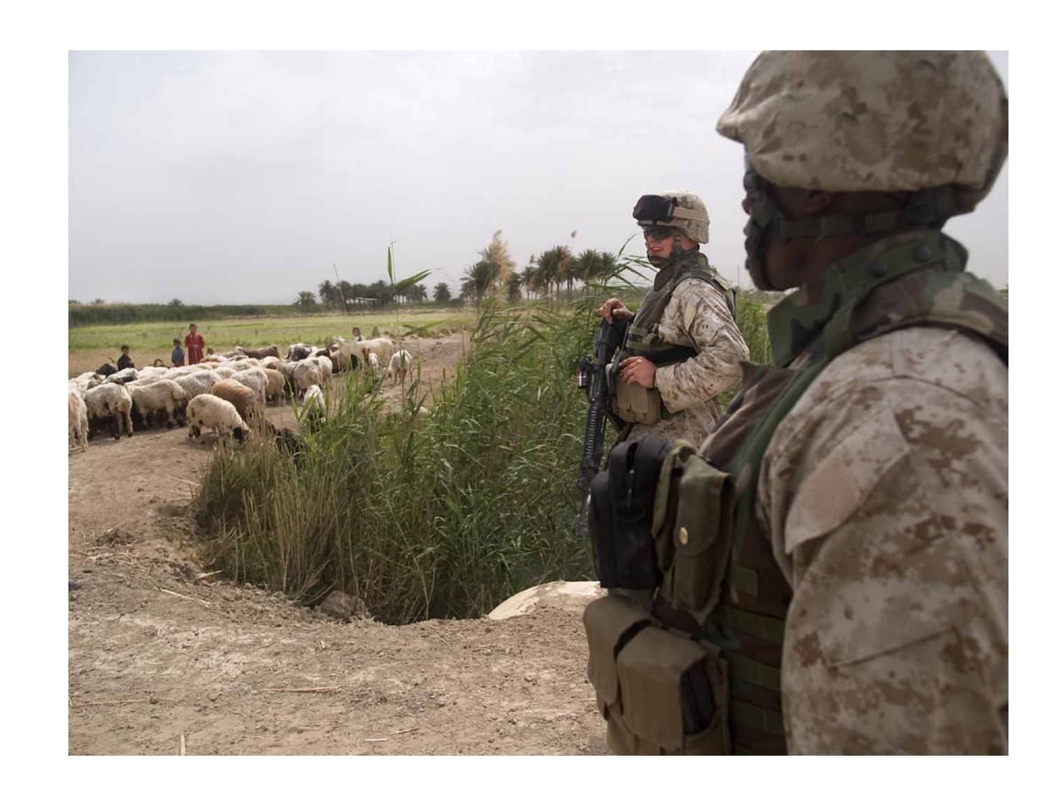
Left, Above, and following two pages: Marines with Team 2, Detachment 2, 5th CAG encounter Iraqi shepherds, children, while inspecting a local water pump in need of repair near Karmah.