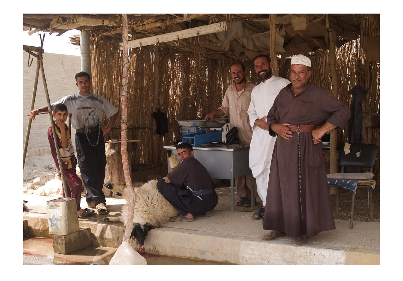
Pages 40–42: A civil affairs partol through the Saqlawiyah souk (market).