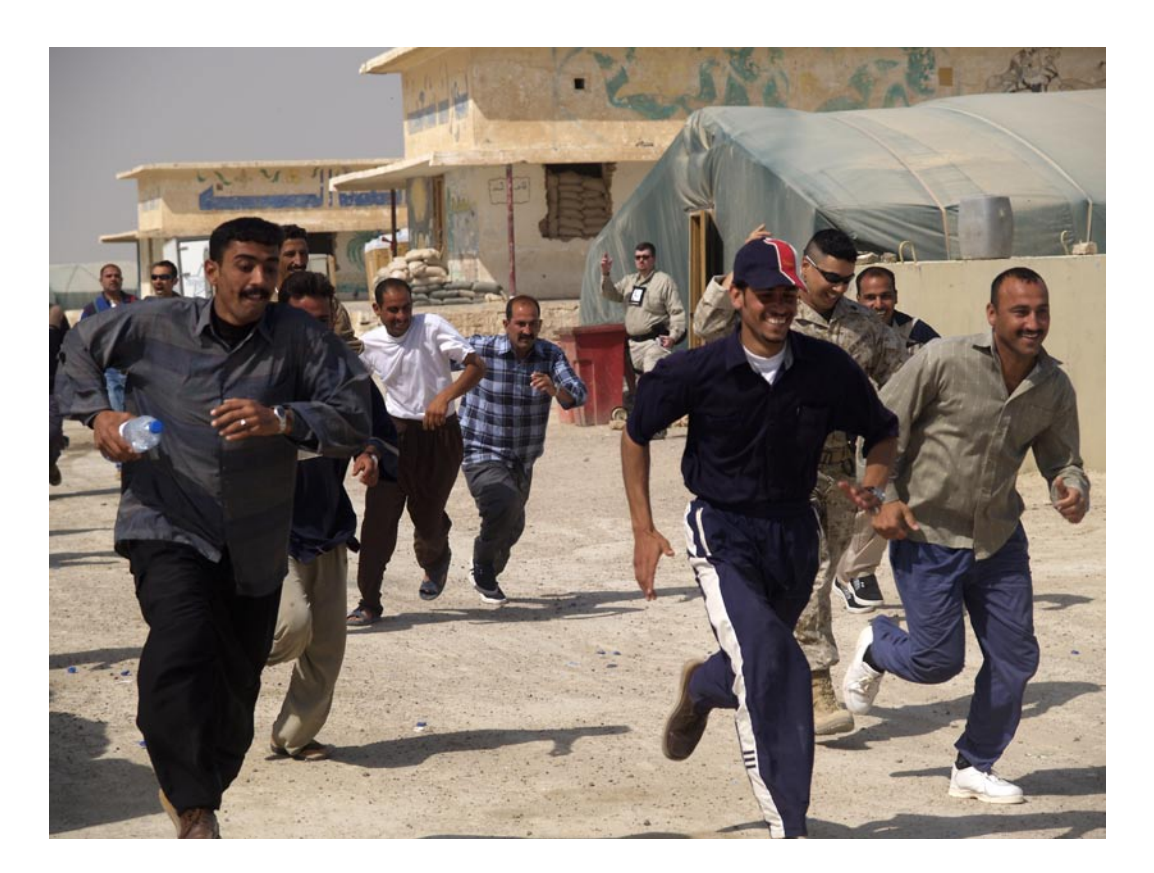
Left and Far Left: Iraqi police candidates conduct a physical fitness test administered by MTT 2 Marines.

"We give them a physical fitness test. We have them do push ups and sit ups, pull ups and a 1500 meter run...they all have their own ways of doing push-ups, sit-ups, and pull-ups and, it may not be Marine Corps standards, but the effect is entertaining enough."