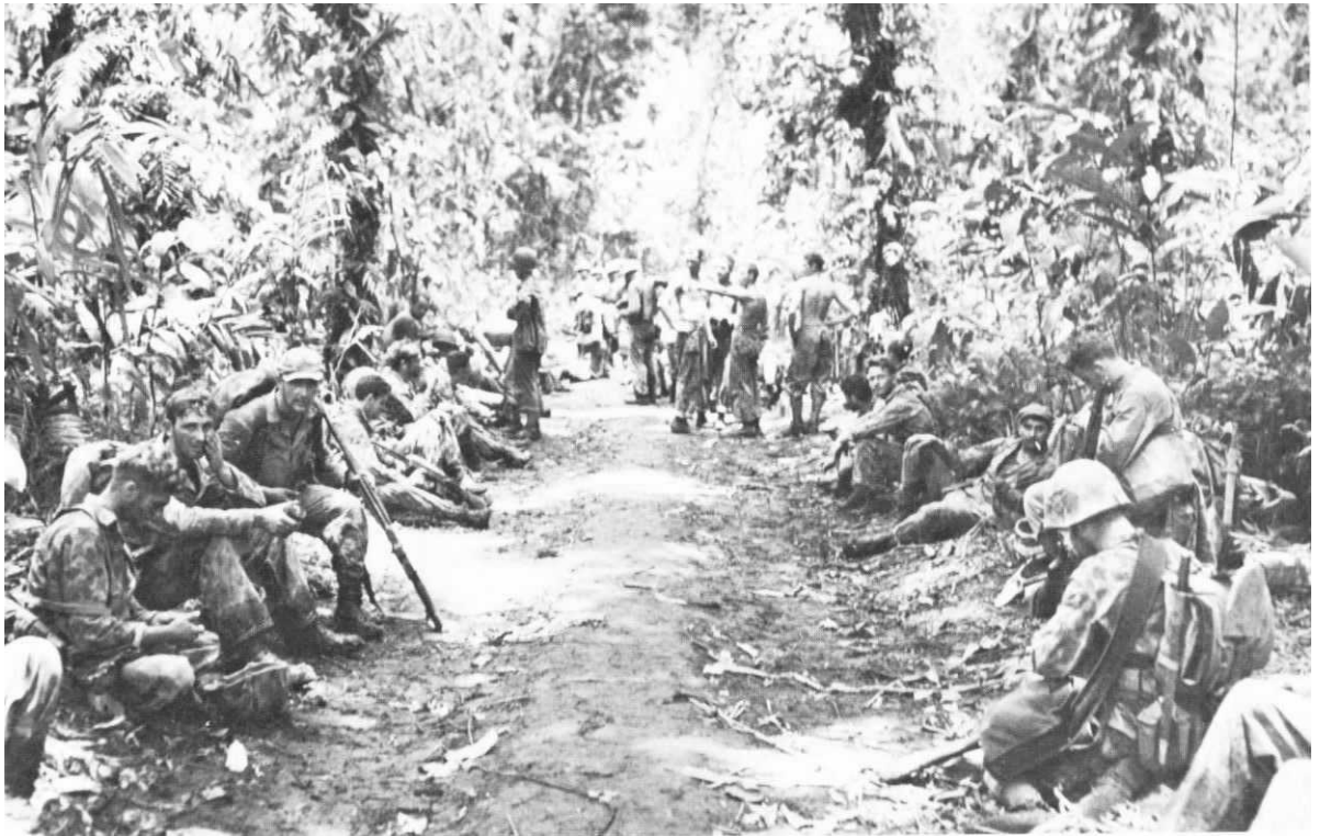
Third Division unit wearing camouflaged uniforms takes a short break along a jungle track as it moves up to the front lines on Bougainville on 4 November 1944.