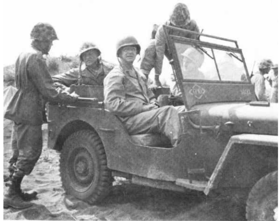
Major General Graves B. Erskine, seated rear, Commanding General, 3d Marine Division, and Vice Admiral Richmond K. Turner, who commanded the expeditionary forces, talk with Marines at the command post of the 21st Marines on Iwo Jima in 1945.