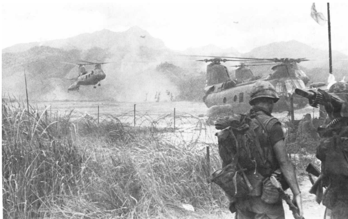
CH-46 helicopters land to pick up the 2d Battalion, 3d Marines, at the beginning of Operation Lancaster II near the Demilitarized Zone in South Vietnam on 17 July 1968.

SINCE THIS TIME, the regiment has continued to maintain the highest level of combat readiness for amphibious warfare by maintaining a rigorous training schedule on all levels of unit operations, engaging in numerous field and fleet exercises, and by providing battalion landing teams for deployment to the Western Pacific.