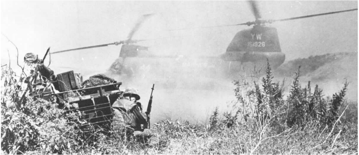
A perimeter guard turns away from the dust raised by a CH-46 as it lands near the 1st Battalion, 26th Marines, during training at Camp Pendleton, California, in June 1966.