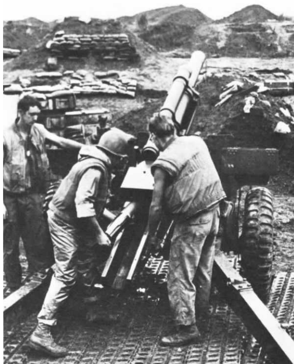
Artillerymen of the 2d Battalion, 12th Marines, at Con Thien, South Vietnam, fire high explosive and white phosphorous shells from a 105mm howitzer at a North Vietnamese Army unit on 19 October 1967.

ELEMENTS OF THE REGIMENT participated in a number of operations in 1965 and 1966 including Starlite, Prairie, New York, and Hastings. On 6 January 1967 at Phu Bai, after the regiment received additional self-propelled 155mm howitzers, the 1st Provisional 155mm Howitzer Battery, 4th Battalion, 12th Marines was activated. By the