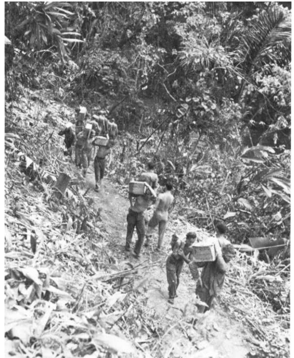
A working party carries food and ammunition to a 3d Marine Division unit on Hand Grenade Hill on Bougainville. The narrow trail hampered resupply.

rying the first assault waves of Colonel Craig's 9th Marines came ashore on the island in the face of Japanese defending fire. The next day the regiment pushed rapidly south along the shore to seize the Piti Navy Yard, and then moved into the hills to help drive out the Japanese. With this task accomplished, the unit became involved in securing the northern portion of Guam. The 9th reached the cliffs on the north coast on the afternoon of 9 August. With the end of organized resistance, the regiment participated in mopping-up operations on Guam.