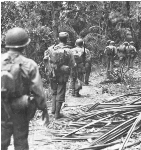
Third Division Marines pursue retreating Japanese along a jungle trail on Guam on 29 July 1944.

my's XIV Corps, the last elements of the 3d Marine Division returned to Guadalcanal.