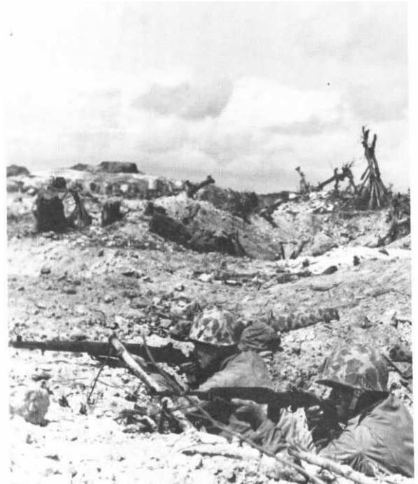
3d Division Marines man hastily prepared position amid the ruins of an Iwo Jima sulfur mine and refinery west of Motoyama Village in March 1945.

BY MID-APRIL 1945, all units of the division were back on Guam, preparing for the next operation. In addition, the division patrolled the southern part of the island. On 3 August 1945, the 3d Marine Division received initial plans for Operation Olympic which called for an amphibious landing on the Japanese home island of Kyushu about 1 November 1945. The 3d Marine Division, along with the 2d and 5th Marine Divisions, was assigned to the V Amphibious Corps for the projected operation. Japan's agreement to cease hostilities and subsequent surrender cancelled Olympic, and the 3d Marine Division remained on Guam until the date of its deactivation on 28 December 1945.