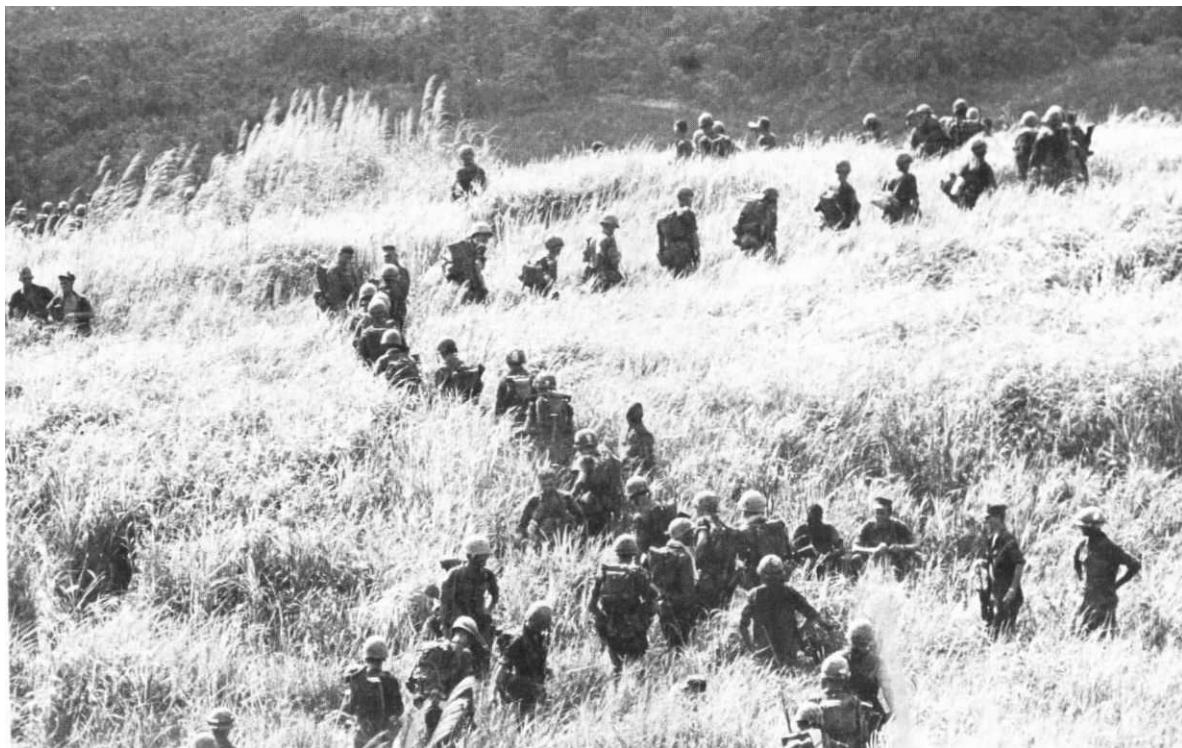
Company G, 2d Battalion, 4th Marines, participating in Operation Hastings in Vietnam in July 1966, moves through high grass south of the Demilitarized Zone.