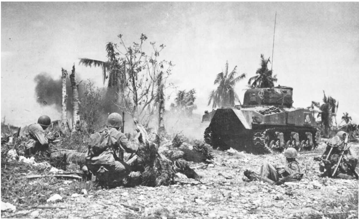
A Marine Sherman tank blasts a Japanese pillbox in advance of 3d Division infantrymen on Guam in August 1944. Marine at right carries a souvenir Japanese sword on his pack.