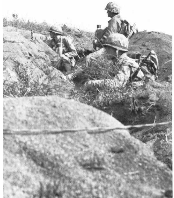
Wary Marines of a 60mm mortar crew of Company L, 3d Battalion, 21st Marines, pause in the attack on Airstrip No. 2 on Iwo Jima on 24 February 1945.

WITH THE BATTLE of Iwo Jima over, the 21st Marines returned to Guam. Here training continued for the planned invasion of the Japanese homeland. After the surrender of Japan, the 2d Battalion, 21st Marines occupied the island of Truk. The 21st Marines was deactivated on Guam on 20 December 1945. The 2d Battalion left Truk in February and was deactivated on Guam on 5 March 1946.