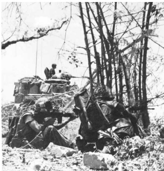
Marine riflemen of the 9th Marines combine firepower with tankers as they engage a well-dug-in North Vietnamese Army unit during Operation Kentucky in the northern part of South Vietnam.

FROM ITS INITIAL LANDING until early 1967, the regiment operated in the area south of Da Nang. Throughout the months of 1966 and early 1967, the 9th Marines conducted numerous search and clear operations to find the enemy, while strengthening the civic action programs to secure relations with the Vietnamese people, and free the people from the constant threat of Viet Cong terrorism. Noteworthy operations during this period were Macon, Mississippi, Independence, and Gulf.