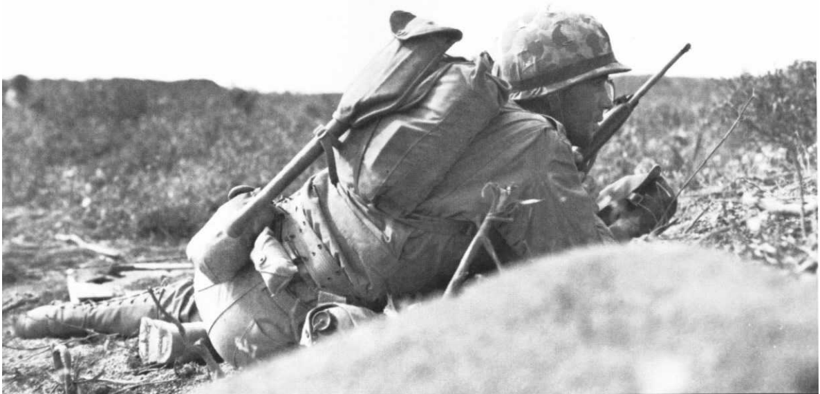
A member of Company L, 3d Battalion, 21st Marines, takes cover from heavy mortar and machine gun fire in the attack on Iwo Jima's Airstrip No. 2 on 24 February 1945.