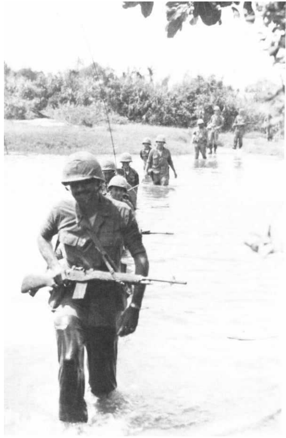
Marines of the 1st Platoon, Company G, 2d Battalion, 3d Marines, wade a shallow stream on patrol on 6 May 1965, shortly after arrival in Vietnam.

OVER THE NEXT FOUR YEARS the division successfully executed more than 120 major operations, including Starlite, Hastings, Scotland, Napoleon/Saline, and Dewey Canyon. In Operation Hastings, division units stopped a North Vietnamese Army (NVA) drive into South Vietnam, and laid groundwork for the division's move north, which occurred on 9 October 1966. Many of its units had already been committed to sealing the Demilitarized Zone (DMZ) against the northern infiltrators. The two northernmost provinces, Quang Tri and Thua Thien, now became the responsibility of the division.