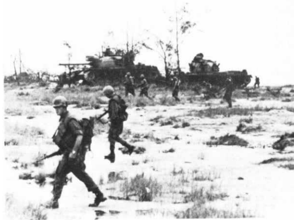
A tank infantry team from 3d Tank Battalion and Company B, 1st Battalion, 3d Marines, leaves its line of departure in an operation along the coastal lowlands of Quang Tri Province in Vietnam in 1968.

THE 3D MARINE DIVISION continues to maintain its combat-ready posture as a force-in-readiness in the Western Pacific and Indian Ocean areas. In numerous amphibious landings and training exercises throughout the region during the 1970s and early 1980s, the Division, as the ground combat element of III Marine Amphibious Force, has remained a highly visible reminder of American commitment to regional stability.