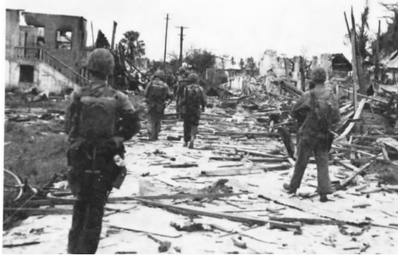
Rubble litters the streets of Agana, Guam, capital of the island and the first American city of any size to be liberated from the Japanese during World War II, as 3d Division Marines advance against the enemy.

THE 3D MARINE DIVISION faced well-organized and determined enemy resistance. The terrain, ideal for defense, was heavily fortified by pillboxes, caves, and covered ar-