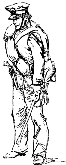
LT. OF MARINE

the Vietnam era he did on-the-scene military art under the auspices of the Marine Corps, Navy, Air Force, and Army. One result of this voluntary effort is two books he published of his work, Vietnam Sketchbook: Drawings from Delta To DMZ (Tuttle, 1968) and Vietnam War Sketches From the Air, Land, and Sea (Tuttle, 1970). For the Marine Corps, since returning to active duty in 1973, he had done a series of paintings on Marines in the Revolution comparable to those of the current exhibition, and another series of posters for the Corps' 200th anniversary, as well as a group of paintings showing the arrival and processing of Vietnamese refugees at Camp Pendleton in 1975. All of these major works have been on exhibit throughout the country.