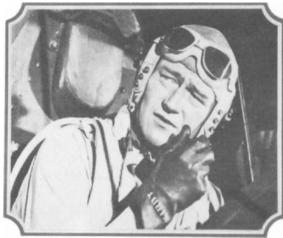
John Wayne, intrepid Corsair pilot, in RKO “Flying Leathernecks.”

What did John Wayne possess which created this “profound” influence? The Duke himself thought it