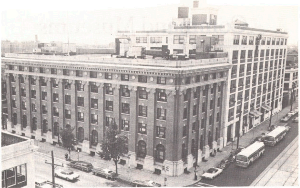
Quartermaster Depot—the name by which most Marines know it—at the Marine Corps Supply Activity, 1100 S. Broad Street, Philadelphia, is Corps' newest entry on National Register of Historic Places. Entrance to the building is behind the mail box, obscured by a tree.

slightly in order to miss the historic site and then nominated the location to the National Register.