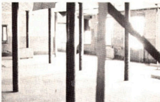
Historians will find this their home after Building 58 is completed. Their writing areas have been designed so that columns will be within walls.