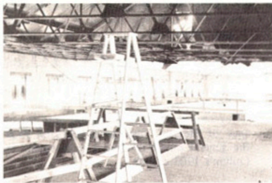
Top floor of Building 58 will house library, personal papers collection, and reference section. False ceiling is being stripped away to expose original high roof.