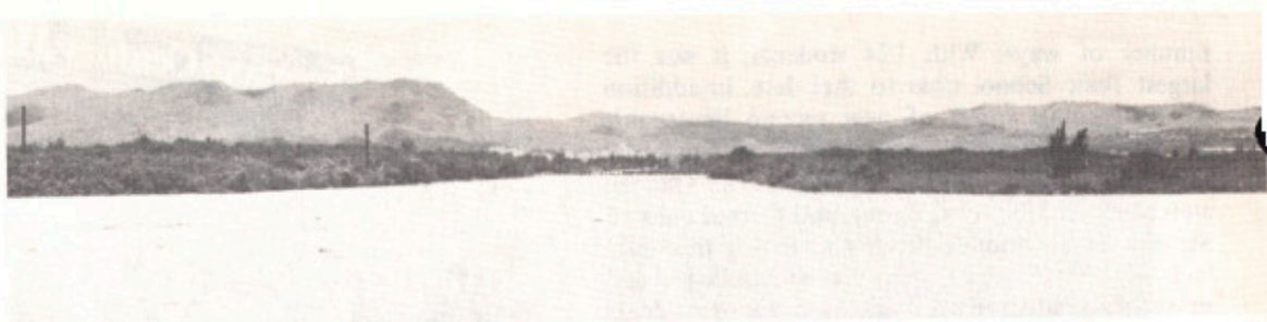
Orote Field, Guam, was site of first Marine aviation deployment in Pacific in 1921, later was used in World War II. It is now on the National Register of Historic Places.