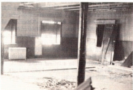
Director of Marine Corps History and Museums office will be at this location after completion of rehabilitation. Wall paneling will be removed and bricked up window, right, will be opened as part of restoration of building.