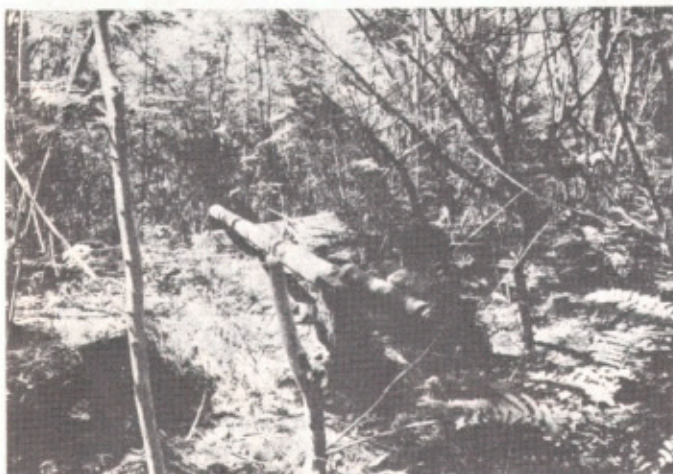
Japanese probably had no chance to fire this 5-inch coast defense gun before Marines landed on Guam.