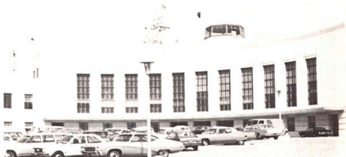
Navy-Marine Corps Museum at Treasure Island will occupy this building, once part of the 1939 San Francisco World's Fair, now the Headquarters, 12th Naval District. The curved 260- by 60-foot entry hall will carry out the theme of Navy and Marine Corps activities in the Pacific from 1813 to the present.

for the museum and reproduction art to add to the club's decor.