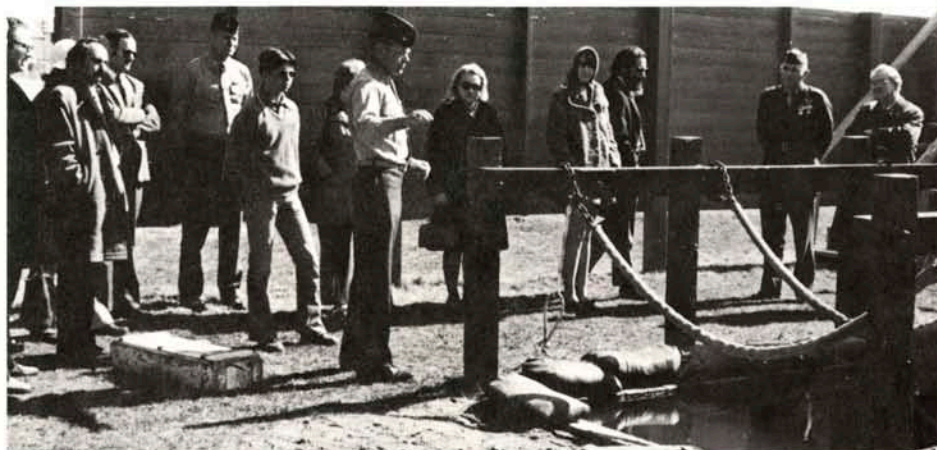
Historians visit Obstacle Course

The purpose was to acquaint the historians with the Corps about which they are writing. The visit was the first of a new series of presentations and seminars for the members of the division.