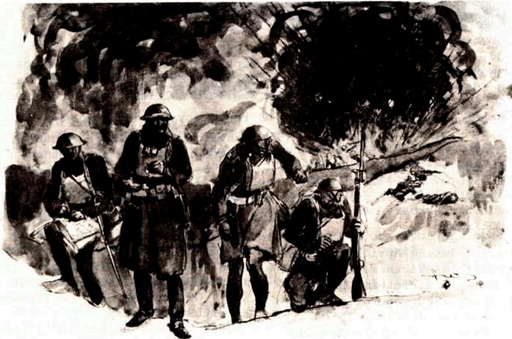
Marines under artillery fire, France 1918