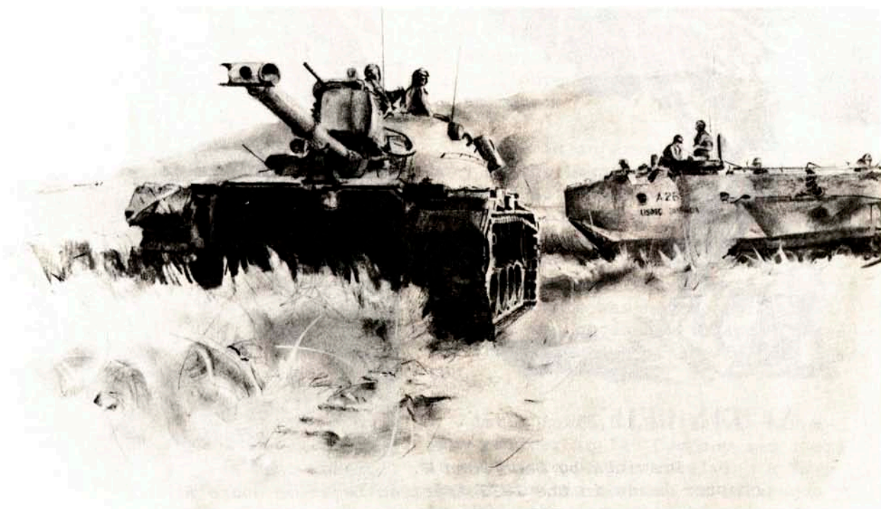
Marines move inland moments after hitting Red Beach 1 on Saros Bay in the Turkish Trace during NATO Exercise Deep Furrow 73

On 19 September 1973 I joined the Reserve officers and men of "B" Company, 1st Battalion, 25th Marines, 4th Marine Division at their home training center in Hartford, Connecticut. We shortly boarded an aircraft for a long transoceanic hop to Izmir, Turkey where we joined the 4th Marine Amphibious Brigade task organized from Fleet Marine Force Atlantic units in North Carolina to participate in the NATO Exercise, DEEP FURROW 73. My role was to cover the event as a Marine combat artist.