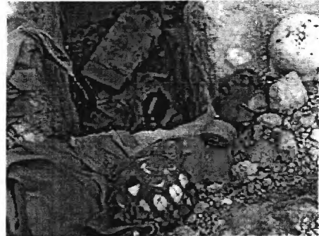
U.S. troops found gas masks in abandoned Iraqi positions on the road to Nasiriya.