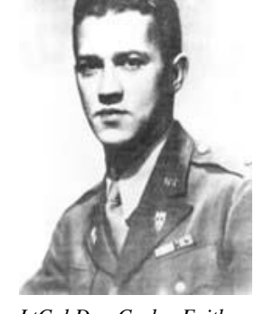
LtCol Don Carlos Faith

marksmanship practice Barber had insisted upon as he shot retreating Chinese. By the morning of 28 November, however, the scope of the disaster in the X Corps area had still not become apparent to the X Corps Commander, although it had become clear to the Marines -- who had been expecting and preparing for it. The soldiers of Task Force MacLean/Faith -- who had been rushed up there in a hasty manner, had little cold-weather gear, and had limited capabilities at combining arms -- were fighting for their lives when Almond helicoptered in on the afternoon of 28 November. The TF Commander, MacLean, was out with one