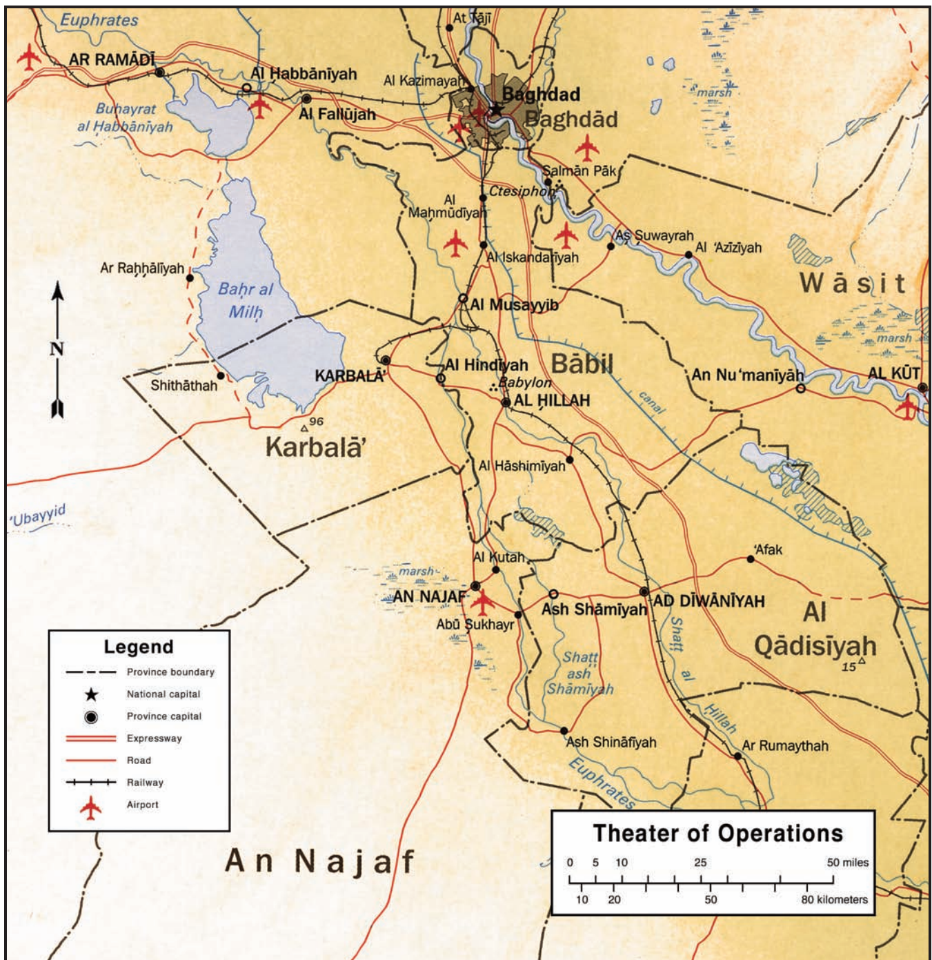
U.S. Marine Corps Map