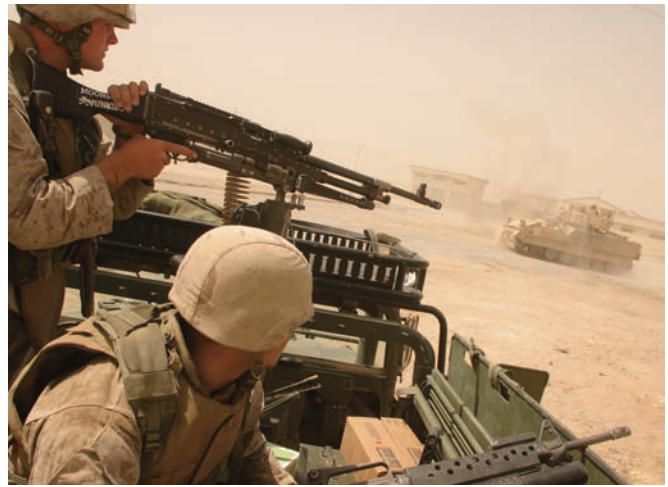
Marines from BLT 1/4 begin their patrolling of an-Najaf, which led to the confrontation with al-Sadr's militia during the Borneo patrol.

As the small convoy moved on, more fighters appeared carrying rifles and rockets. The 28 May truce forbade the militia from possessing such weapons, but plans for disarming the militiamen had never developed. The routine orientation patrol had inadvertently driven by al-Sadr's house and a women's maternity hospital, locales that the militia considered off limits to Coalition presence. Although these locations were technically not in the exclusion zone, Coalition forces had stayed out of