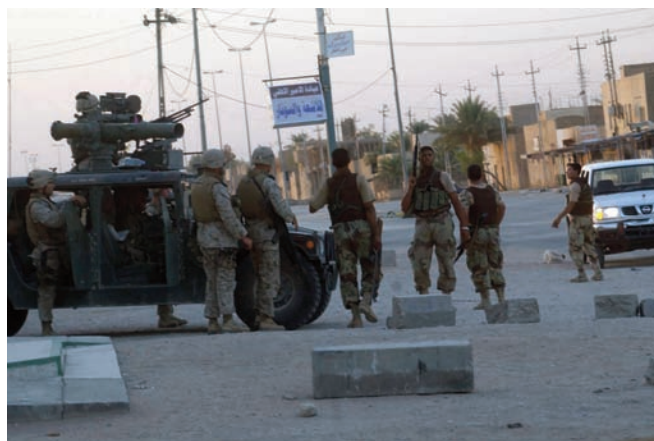
Marines and Iraqi National Guard soldiers set up a checkpoint using a Humvee equipped with TOW guided missile and machine gun.

While al-Sadr stalled peace negotiations, the Coalition continued planning for its final assault. Augmentation neared completion as multiple units gathered and staged at various forward operating bases. There they awaited for orders to deploy. The only real delay came from indecision over which direction to begin the assault on the Imam Ali Mosque. Planners favored an attack from