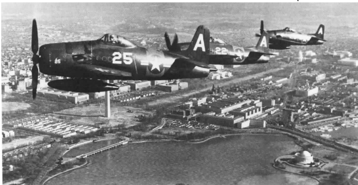
Marine Corps Historical Collection

In 1949, VMF-321 gave up its F4Us for Grumman F6F Hellcats and shortly thereafter, Grumman F8F Bearcats. Considered by many to be the ultimate prop fighter, the powerful little Bearcat could be demanding to fly. Three F8Fs of VMF-321 fly over the Capitol area, the Tidal Basin, and various monuments in 1950. The squadron soon relinquished its Bearcats to the hard-pressed French in Indochina (Vietnam), and went back to F4Us.