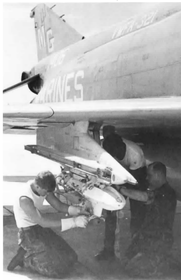
Marine Corps Historical Collection

Members of the squadron's ground crew adjust a Phantom's triple ejector rack before a training mission.