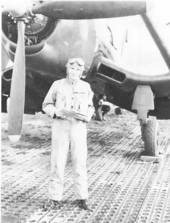
1stLt Emil Skocpol stands in front of his F4U Corsair in February 1949 at NAS Anacostia. The aircraft's four-bladed prop and apparently new tires are evident.

An F4U-4 Corsair of VMF-321 is parked at NAS Anacostia. The aircraft carries the characteristic orange band around the rear fuselage identifying it as a Reserve aircraft.