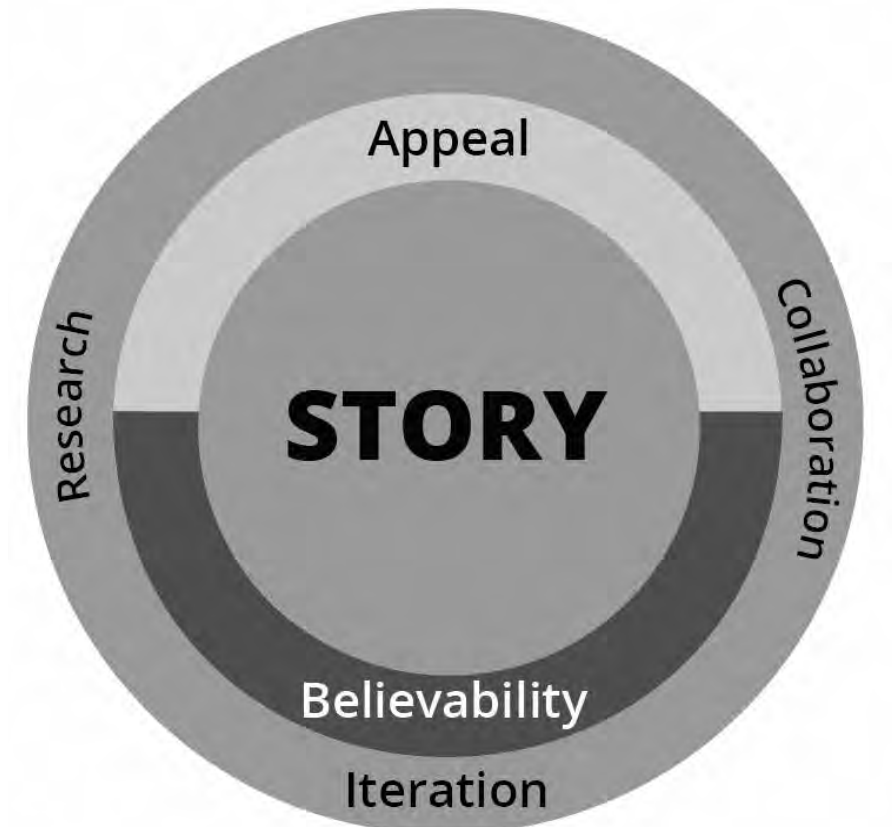
Figure 1. Pixar's three main design principles—story, appeal, and believability