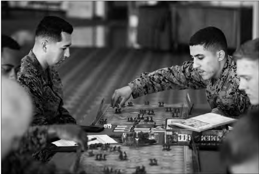
Figure 3. Exploiting terrain in Memoir '44 at a 3d Marine Division wargame tournament