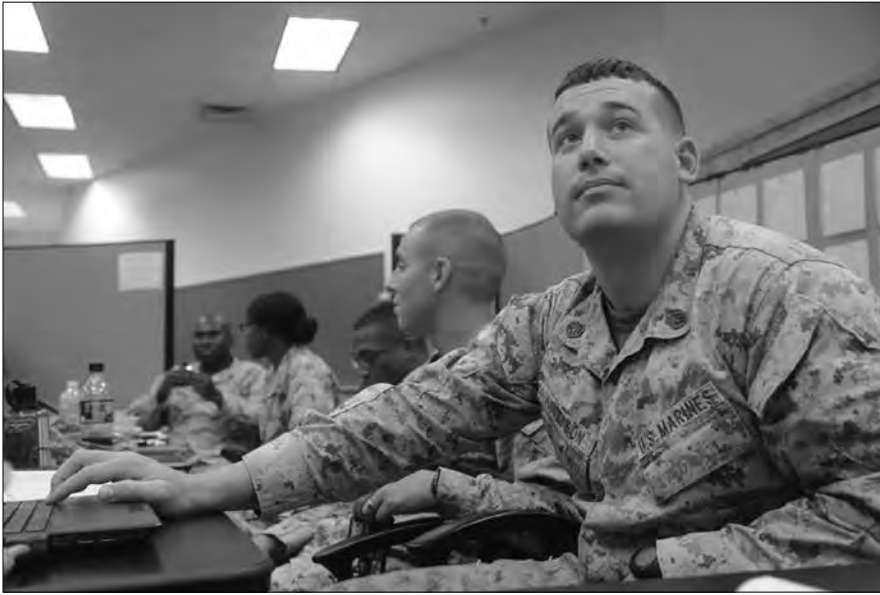
Figure 1. Marines work at a Command Operations Center during a logistics war-game aboard Marine Corps Base Quantico