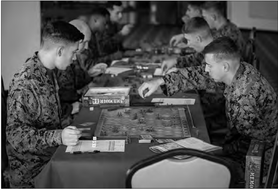
Figure 2. 3d Marine Division challenges junior Marines in a Memoir '44 wargame tournament