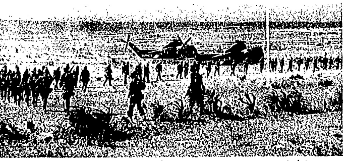
4th Marines depart drop zone, RVN, Jul 1966.

The Marine Corps. had six divisions by late summer 1944. The first two divisions came into existence in February 1941 by the redesignation of the 1st and 2d Marine Brigades. Discussion on the formation of divisions within the Marine Corps began soon after the end of World War 1. Plans varied as to the possible composition with numerous ideas being put forth. One suggestion called for the creation within the division of an antiaircraft regiment of three battalions. This suggestion was made in 1936; however, no antiaircraft regiment was ever activated. A more unusual proposal had occurred three years earlier. A strong recommendation was made for the inclusion of a medical regiment as one of the organic units in any future division. The composition of this medical regiment included a headquarters element and two battalions, each consisting of a headquarters company, collecting company, ambulance company, and hospital company. This proposal was never adopted. Instead, the divisions, once formed, were assigned only a single medical battalion.