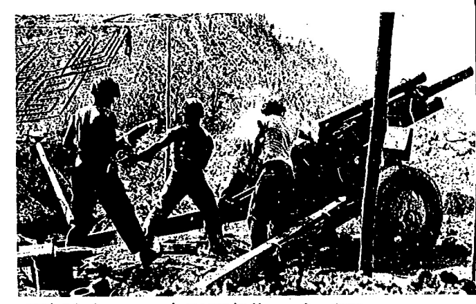
1'Ith Marines pound enemy in Korea, Jun 1951.

The Marine Corps nearly tripled in size in the two years preceding the attack on Pearl Harbor. An outgrowth of this expansion was the reactivation of the 8th and 10th Marines in 1940. Four more regiments were reborn in early 1941—the 1st, 2d, 7th, and 11th. The eruption of hostilities caused a rapid increase in the strength of the Corps. In less than four years it reached a peak of 485,053. Twenty-nine infantry, artillery, and engineer regiments saw active duty during the war, although all were not in existence at the same time. Every regiment with the exception of the 16th Marines participated in at least one World War II campaign. Additionally, a number of specialized regiments including raider, parachute, and service regiments were created. One of these organizations, the 1st Raider Regiment, was used to reform the 4th Marines when that unit was reconstituted in 1944. Two years before, the 4th Marines was forced to surrender to the Japanese on Corregidor. This was the first and only time a Marine unit of a battalion size or larger was captured by enemy troops. With the capture of the 4th Marines the only unit in the Marine Corps to have uninterrupted service since 1914 temporarily dropped from the rolls. Reactivation of the regiment came about partly as a result of fulfilling a need for more infantry regiments and partly because of the desire to preserve the lineage and honors of the 4th Marines.