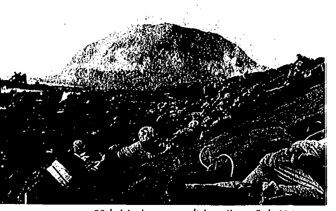
28th Marines assault Iwo Jima, Fab 1945.

The 5th Regiment was the first of 10 regiments to be organized during the war. Immediately after its formation the regiment was sent to France during June and July 1917. The 6th Regiment which was activated a few weeks after the 5th was also ordered to France. Most of the unit arrived in October and November 1917 with the last elements disembarking in France in February 1918. The next three regiments to be brought into existence—the 7th, 8th, and 9th—never saw service in Europe. The 7th Regiment was specifically created for occupation duty in Cuba. The 8th and 9th Regiments formed part of the 3d Brigade organized to thwart any potential German attempts to seize areas in the Caribbean and Central America. The Marine Corps' first artillery regiment, the 10th, was redesignated from the Mobile Artillery Force. It has the distinction of being the only Marine regiment to function solely as an artillery organization through its entire history. This unit had originally been trained and equipped with heavy guns for service in Europe. Yet, inter-service rivalry prevented the regiment from seeing action during the war. The